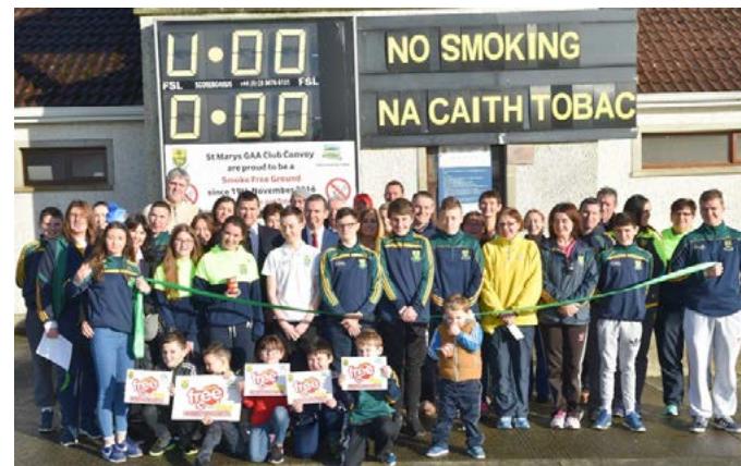
Members of St Mary's Convooy GAA Club in Donegal at their Smoke Free launch

St Mary's were inspired by St John's Volunteers in Wexford who were the first club in Ireland to completely ban smoking in the club grounds back in 2014.