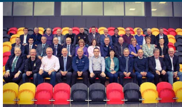
Members of the GAA Club Leadership Development Programme, pictured in the NGDC, Abbottstown

“Our tutor engaged everyone very well in a relaxed manner while delivering key information clearly. It was very helpful to hear from an experienced officer who was able to back up points with personal stories.”