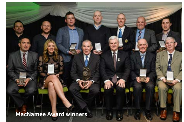
MacNamee Award winners