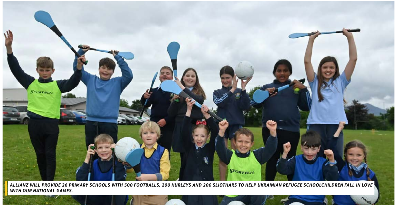
ALLIANZ WILL PROVIDE 26 PRIMARY SCHOOLS WITH 500 FOOTBALLS, 200 HURLEYS AND 200 SLIOTHARS TO HELP UKRAINIAN REFUGEE SCHOOLCHILDREN FALL IN LOVE WITH OUR NATIONAL GAMES.

“From Armagh to Wexford, we are thrilled with the outpouring of support from schools across the country through this initiative with Allianz. These schools are playing such an important role in welcoming Ukrainian schoolchildren into our communities. By joining these local GAA activities, we hope the Ukrainian children feel welcome in our communities and learn the skills they need to enjoy our national games. Ukrainian children have featured in Cumann na mBunscol activities already this school term, thus making new friends and integrating more easily in their new surroundings. We look forward to working