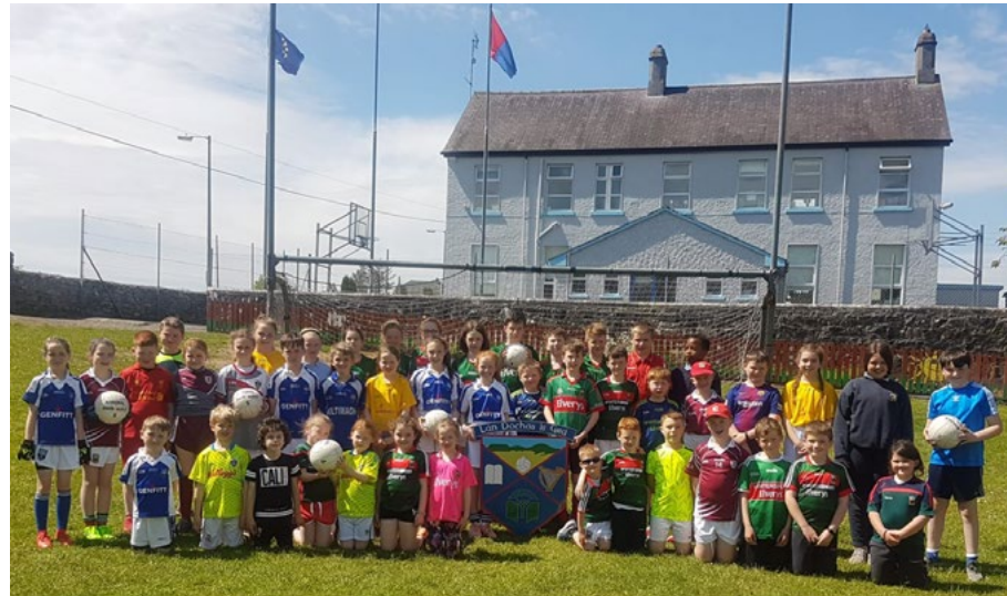
Boys and girls from Craggagh National School playing in the steep slopes of Sliabh Cairn in Balla, County Mayo