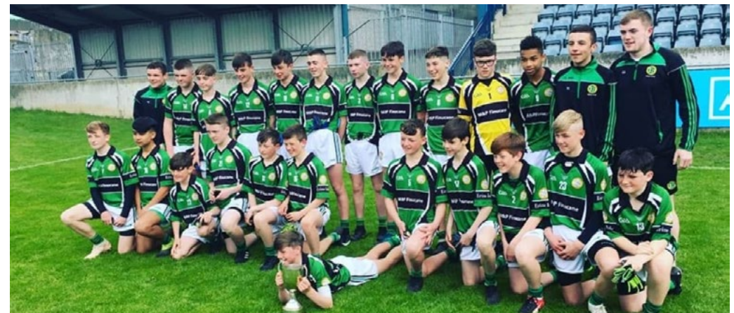
The Erin's Isle team that won the Dublin 2019 Féile Peil na nÓg Division 2 title.

"If we increase the standard of the facilities, if we get the coaching standards to a higher level then hopefully we will see an increase in numbers, because ultimately it's a numbers game."