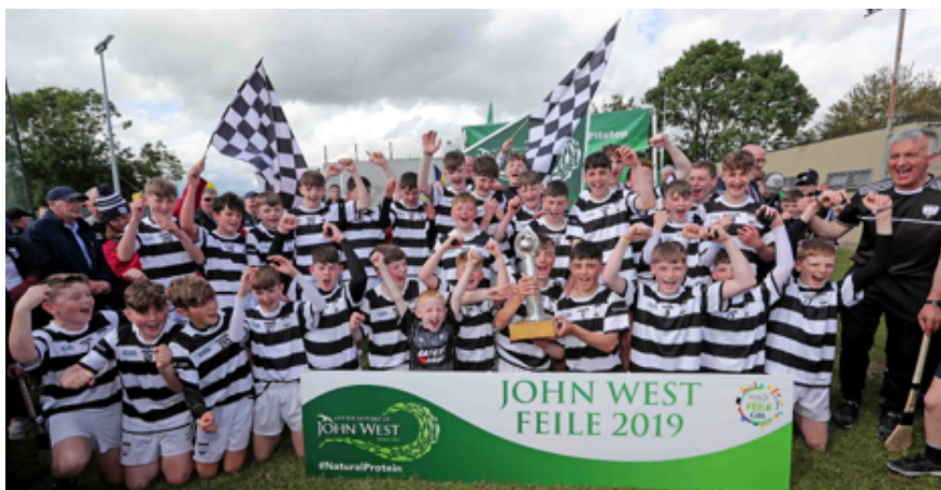
Div 1 John West Féile champs Turloughmore from Galway

See full results on https://www.gaa.ie/feile-na-ngael/results