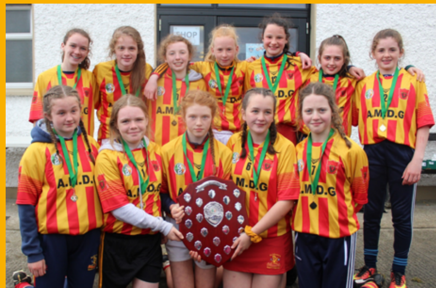
All-Ireland girls' champions – The Harps of Laois