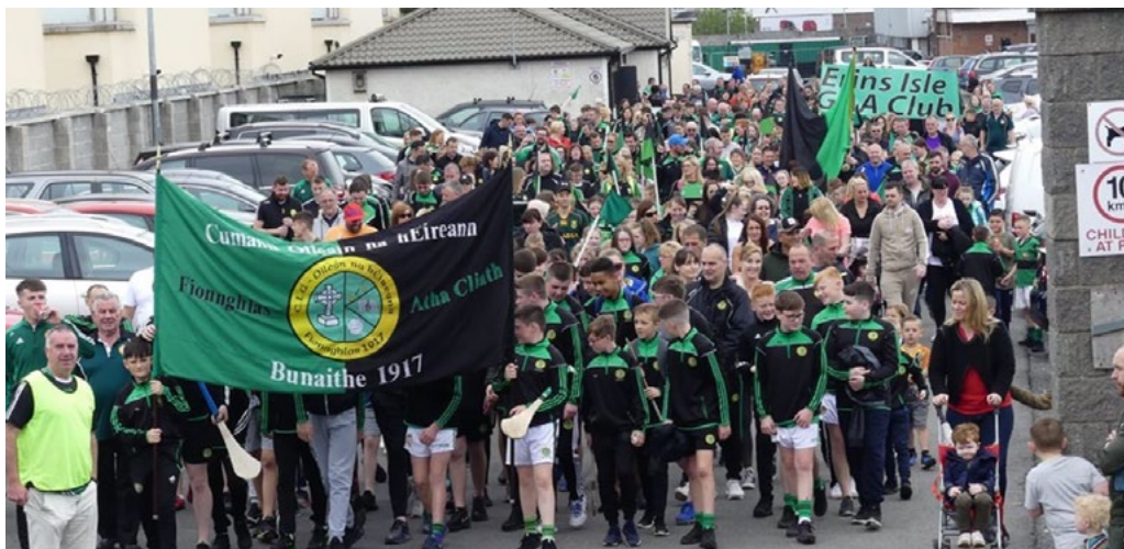
Erin's Isle GAA club members march towards their club grounds after completing their 'Miles for Isles' sponsored walk.

The club isn't just focused giving the youth of Finglas an opportunity to play Gaelic Games.