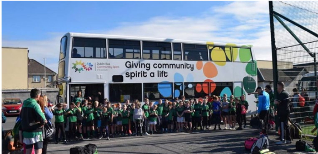
Erin's Isle juveniles pictured before taking part in the 2018 'Mini Muckers' run at Punchestown.

Well-rounded people tend to make well-rounded players and club volunteers, which is why Erin's Isle have taken a very holistic approach to how they engage with their younger members.