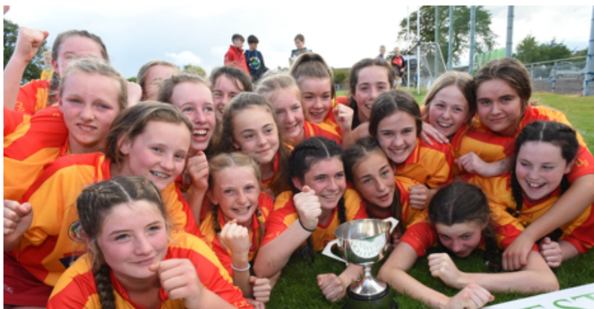
Éire Óg with their camogie cup from their John West Féile success