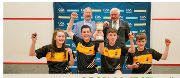
1 Wall Bopys Div 1 winners – Clough Ballacolla from Laois