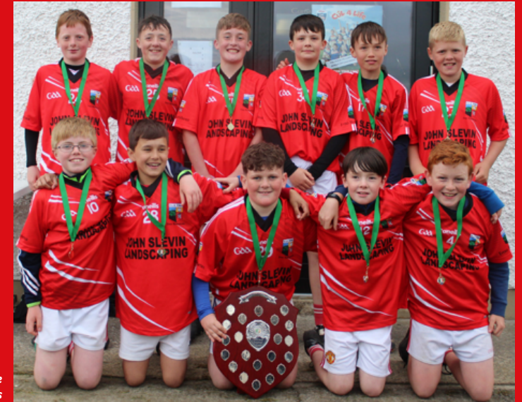
All-Ireland boys champions at John West Féile – Emo of Laois

They saw off tough competition from The Heath, Easkey, Cuchulainn, Ballybrown, Clonbroney, and Skryne, to earn their spot in the Final, which they would go on to narrowly win 9-7 against local club, The Heath.