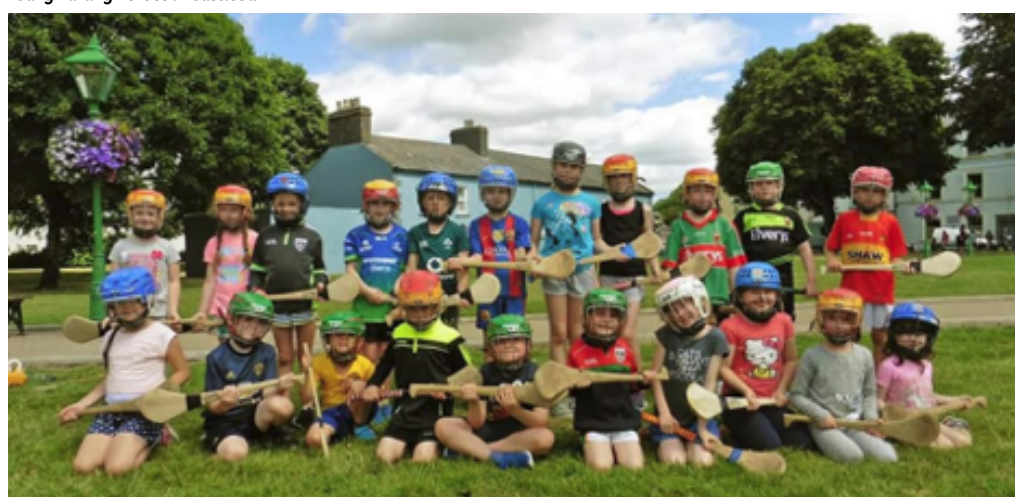
The future of hurling and camogie in Castlebar having fun on the green