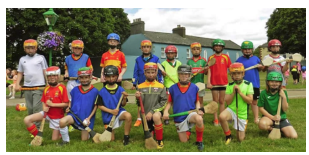
Young hurling heroes in Castlebar

The Hurling on the Green motto is nobody is ever left out and it has been that way from the first day and continue to strive to those ideals to this day.