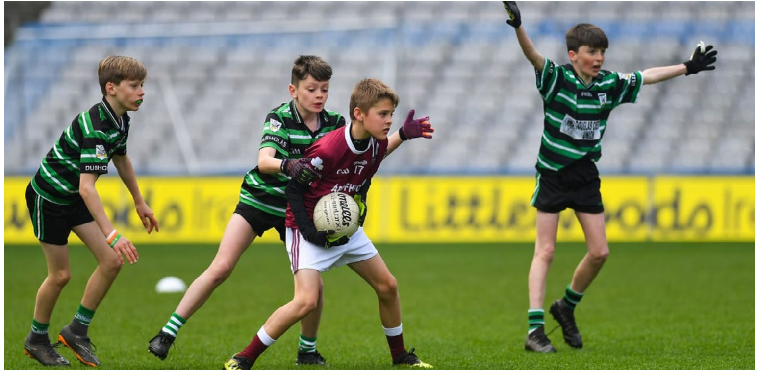
An online tool will soon be able to help GAA clubs plan for the future by letting them know how many potential young players will be available to their club a number of years into the future.

Going forward, he hopes these rules and regulations can be simplified and made more