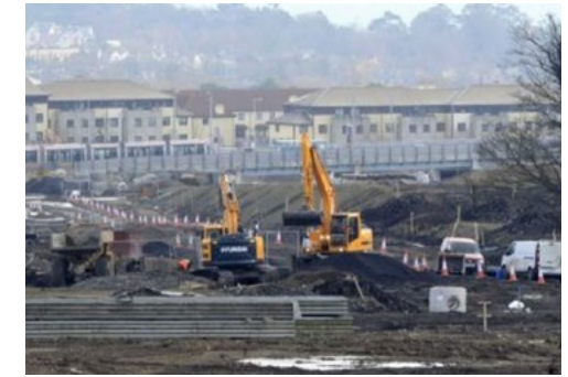
Construction is underway in Cherrywood in South Dublin of a new ‘town’ that will accommodate an estimated 25,000 people.

“We need to be getting in and making our argument for more green space because in a few years as the communities are developed then the demand for the GAA will arise. But if the recreational land isn’t available then it will be very difficult to provide facilities, and that’s just for the new communities.