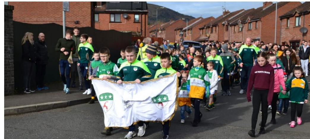
Young Davitts GAC members march towards Davitt Park on the day it was opened in February.

“It should bring everyone together and it’s down to us now to basically just push it and promote and get the buy-in from our