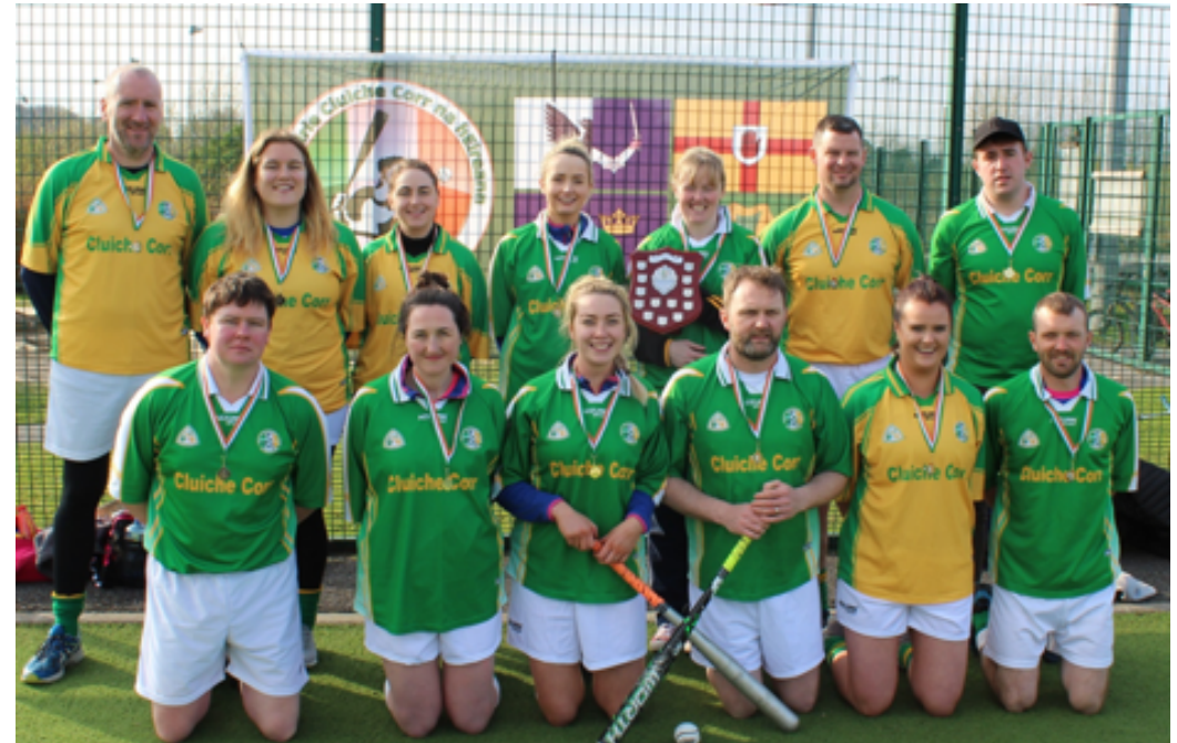
Rounders Champions from Leinster