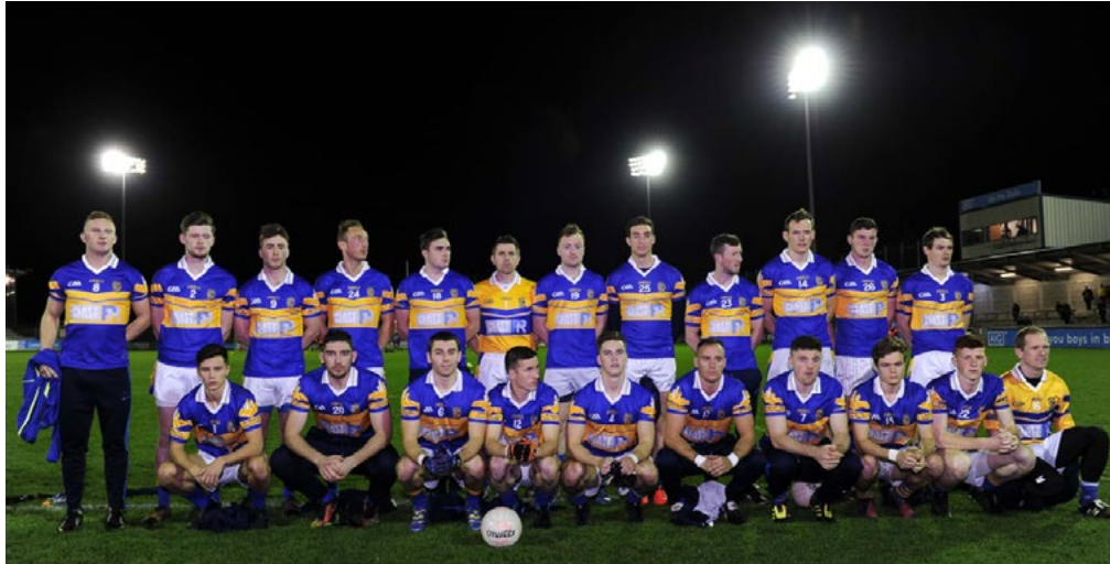
Castleknock GAA club are a rare example of a 'young' club thriving in an urban area. Founded in 1998, they contested the Dublin SFC Final in 2016.

also gravitate towards the existing club.