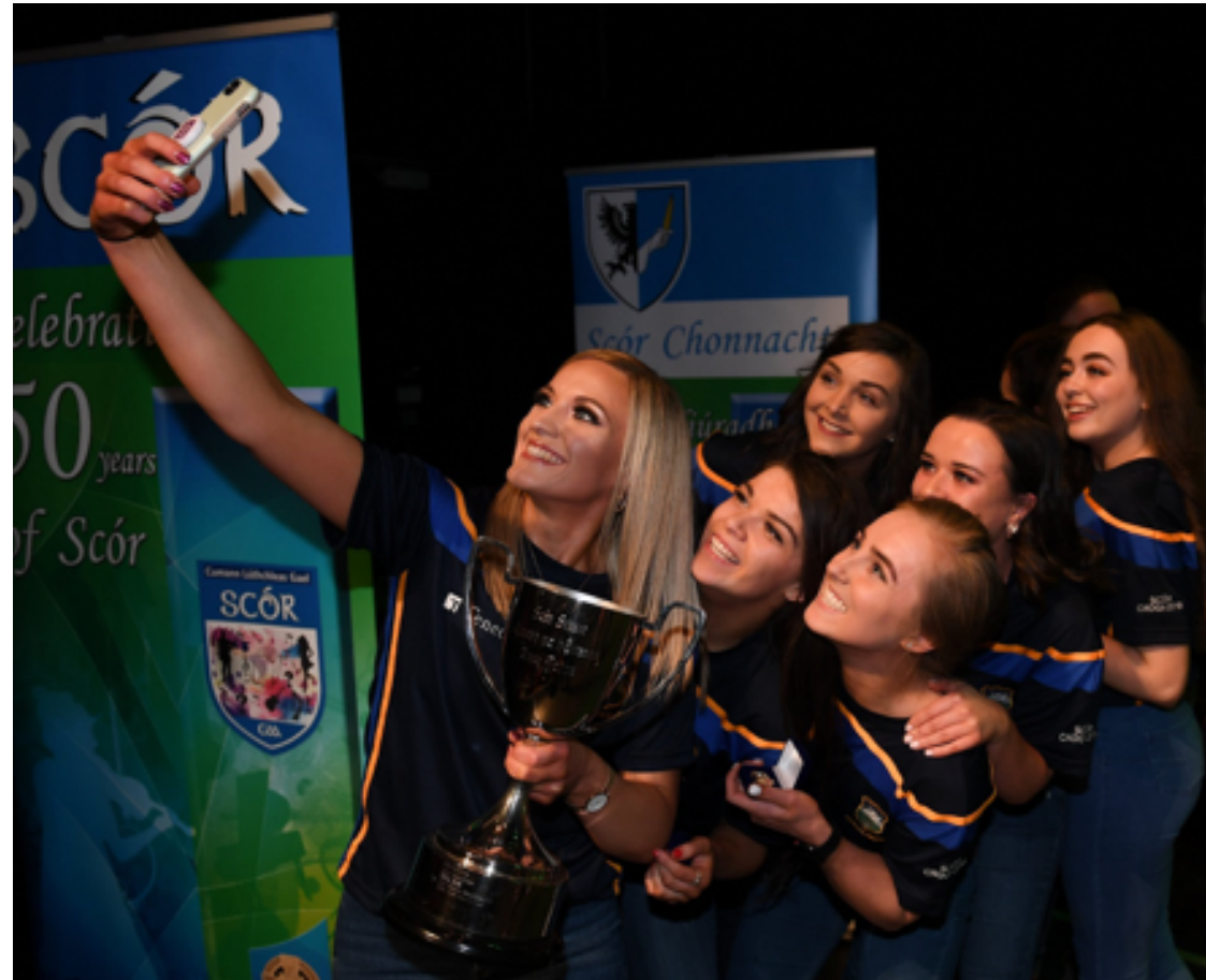
Rinceoirí Foirne C.L.G. an Chaisleáin Nua ag ceiliúradh a mbua

Rince Seit: C.L.G., Achadh Mór, Co. Mhaigh Eo