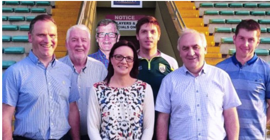
The hard-working team driving club leadership in Kerry GAA