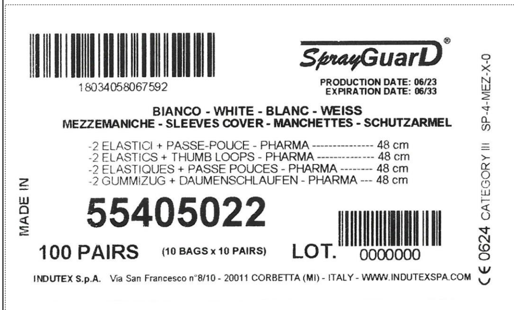
Etiquette pour carton