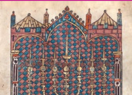
Illustration from The Rothschild Pentateuch

Jewish Free Loan invited major donors to an exclusive curator-led tour at the Getty Museum, The Art of Three Faiths: A Torah, a Bible and a Qur'an . Guests were privy to one