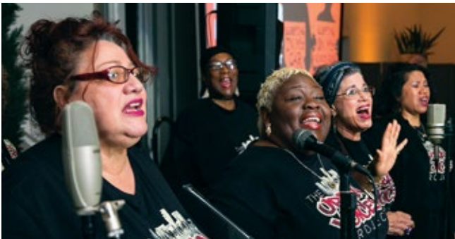
The event featured a performance by The Urban Voices Project, a choir comprised of homeless and formerly homeless people.