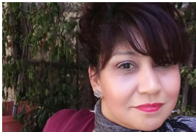
JFLA helped Mendy with rent, utilities, and other expenses when she tested positive for COVID-19 and was out of work for a full month.