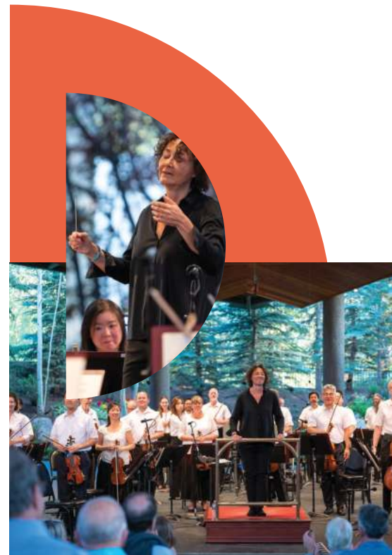
Principal Guest Conductor Designate Nathalie Stutzmann with the Orchestra at the Bravo! Vail Music Festival in July