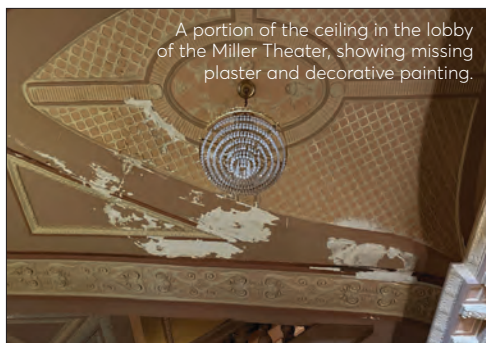
A portion of the ceiling in the lobby of the Miller Theater, showing missing plaster and decorative painting.

There is a need for investment to help maintain the Kimmel's renowned roof, including the funding of a custom-made caulk inspection "roving unit" that would traverse the roof's ribs to perform the necessary caulk maintenance and glass examination.