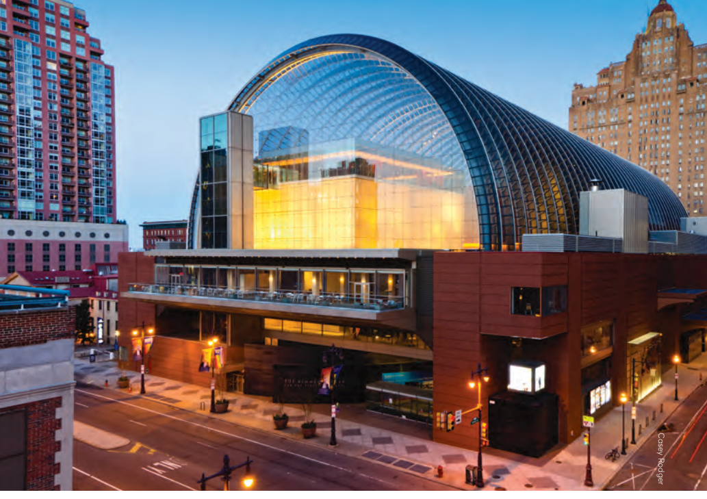
The iconic barrel-vaulted roof of the Kimmel Center for the Performing Arts contains 5.808 individual windows and 19 miles of caulk.