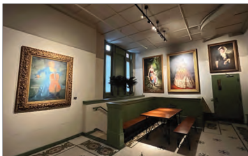
The recently renovated Green Room at the Academy of Music, with paintings of cellist Beatrice Harrison (far left) and sopranos Emma Nevada and Marietta Gazzaniga (back wall, left and center). All three appeared at the Academy of Music, Harrison with The Philadelphia Orchestra and Nevada and Gazzaniga in opera productions in the 19th century. Gazzaniga was Leonore in Verdi’s Il trovatore on February 25, 1857, the first operatic performance at the Academy.