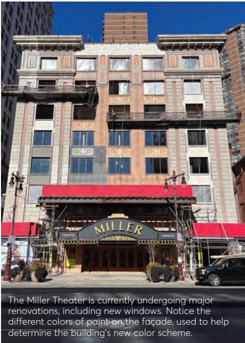
The Miller Theater is currently undergoing major renovations, including new windows. Notice the different colors of paint on the façade, used to help determine the building's new color scheme.

Of course, the Kimmel Center building is most famous for its barrel-vaulted roof, with arches that gleam high above Broad Street thanks to 5,808 individual windows. This award-winning architectural gem requires serious maintenance. "We've got 100,000 linear feet of caulk in our barrel vault, which is over 19 miles of caulk. And it all needs to be addressed, but at different times, because some of it cracks early and some hangs on for a while," Stark noted. ►