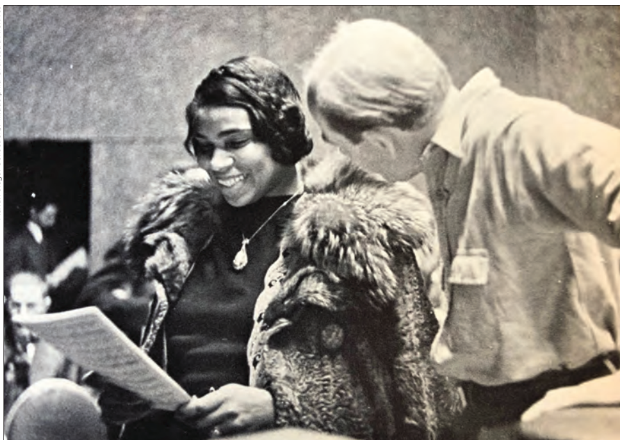
Marian Anderson with Music Director Eugene Ormandy during a Philadelphia Orchestra rehearsal at the Academy of Music in December 1938

Adrian Siegel Collection/Philadelphia Orchestra Archives