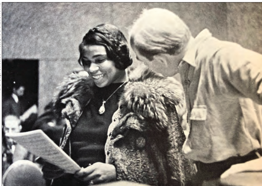
Marian Anderson with Music Director Eugene Ormandy during a Philadelphia Orchestra rehearsal at the Academy of Music in December 1938