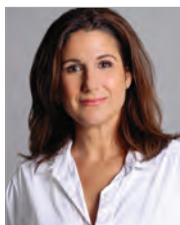
Stephanie J. Block Into The Woods, The Cher Show