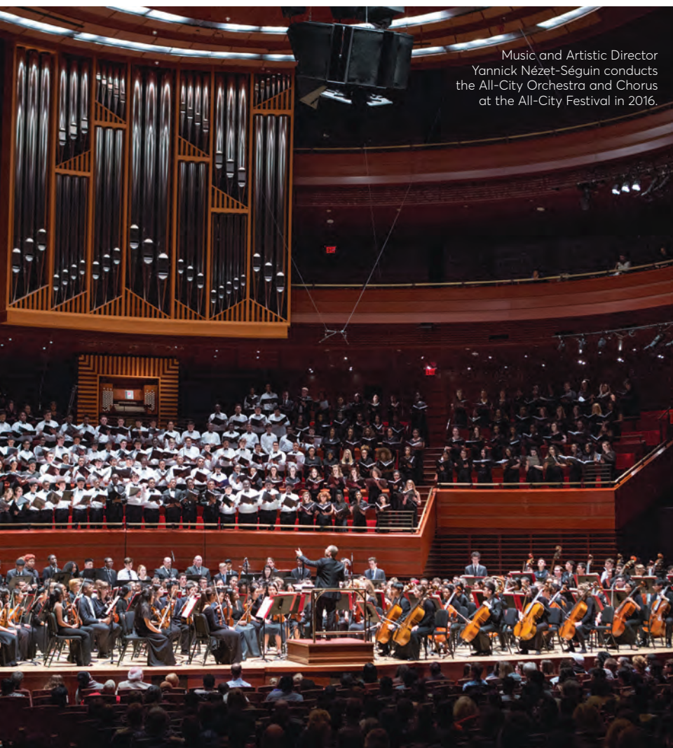
Music and Artistic Director Yannick Nézet-Séguin conducts the All-City Orchestra and Chorus at the All-City Festival in 2016.