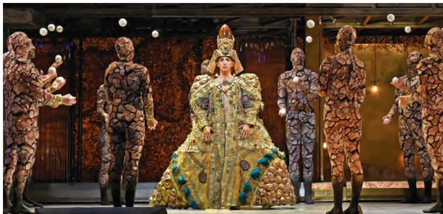
Anthony Roth Costanzo, Philip Glass's Akhnaton. The Metropolitan Opera.

A Continuing Care Retirement Community | ★★★★★ Five-Star Rated Healthcare