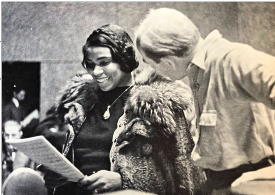
Marian Anderson with Music Director Eugene Ormandy during a Philadelphia Orchestra rehearsal at the Academy of Music in December 1938