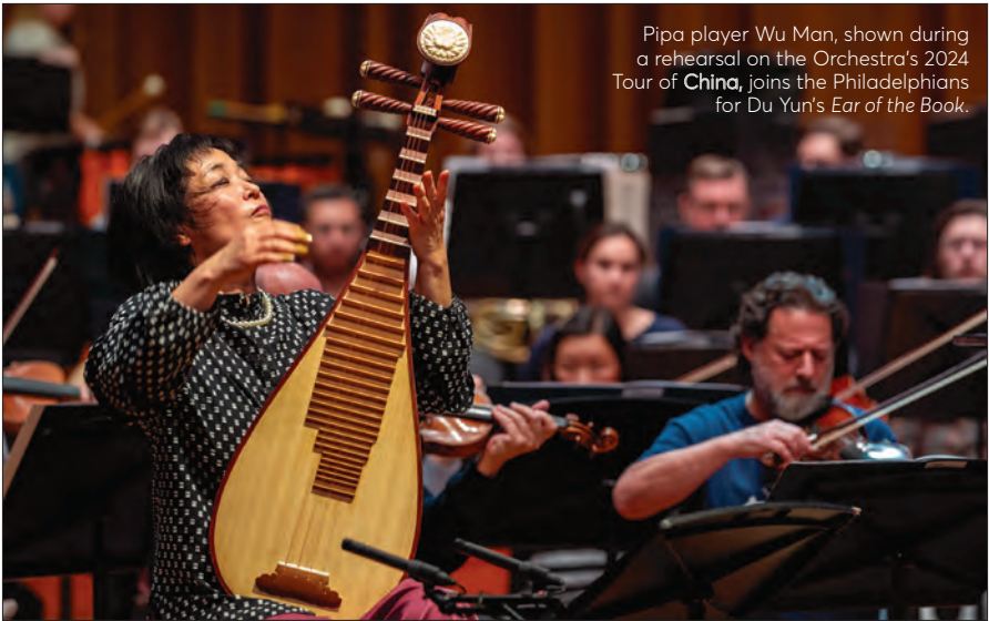
Pipa player Wu Man, shown during a rehearsal on the Orchestra's 2024 Tour of China, joins the Philadelphians for Du Yun's Ear of the Book .