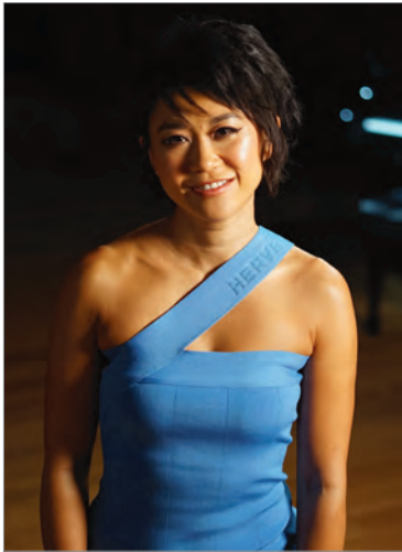
On the Cover: Specially designed art for the Hélène Grimaud Plays Brahms concerts, February 27–March 1, 2025, by Haeg Design

Page 2 From the Interim President and CEO