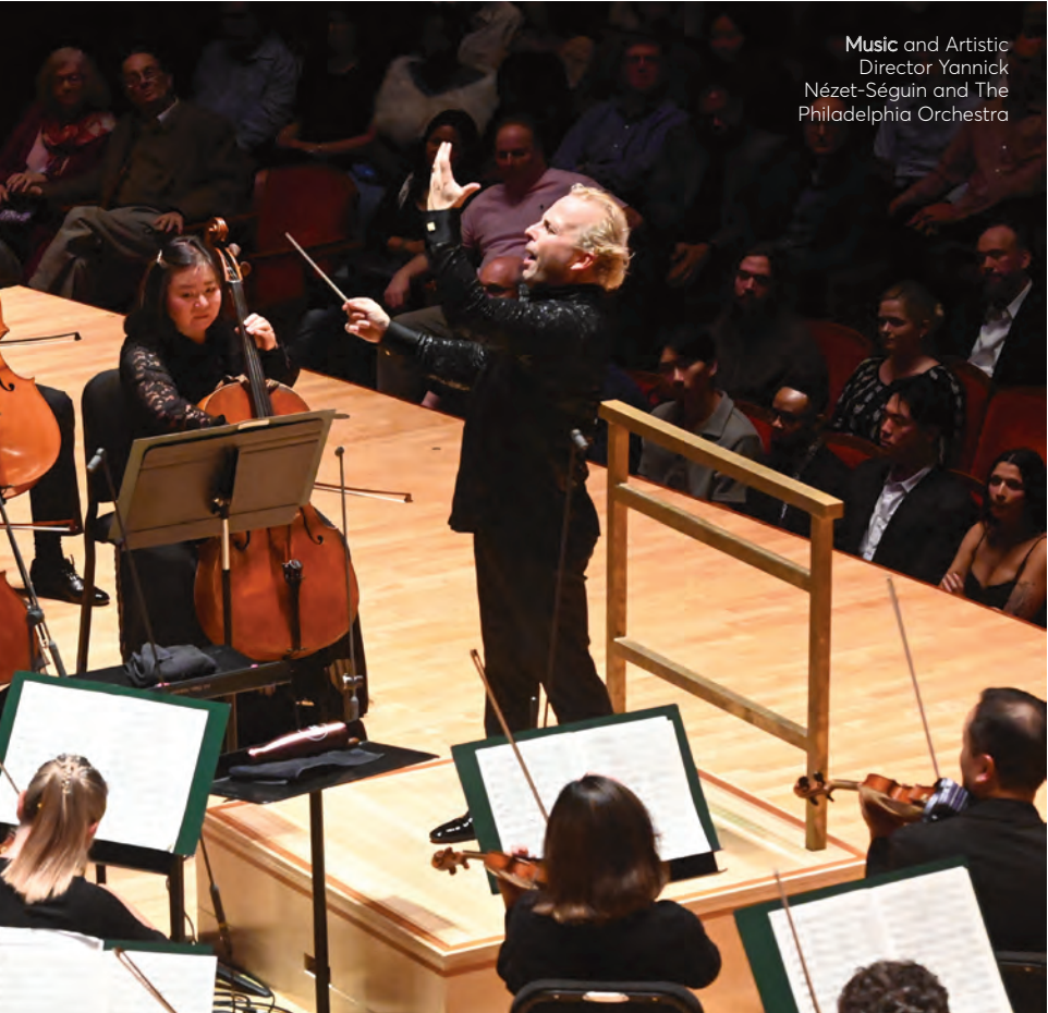
Music and Artistic Director Yannick Nézet-Séguin and The Philadelphia Orchestra

“The 2025–26 season of The Philadelphia Orchestra is a joyful celebration—of the Orchestra’s 125 years of musical brilliance and of America’s 250th birthday,” said Music and Artistic Director Yannick Nézet-Séguin. “In this year-long musical fête, we will illuminate works by Bartók, Ravel, Shostakovich, Sibelius, Stravinsky, and more—many of which The Philadelphia Orchestra introduced to America. We will honor the significant yet often overlooked voices of Amy Beach, Julius Eastman, and William Grant Still, whose contributions to American music reflect the cultural landscape of our nation. And, as always, we will create a path for the future of music with 21st-century commissions from John Adams, Wynton Marsalis, Tyshawn Sorey, Julia Wolfe, and Du Yun, and other contemporary voices. Please come celebrate with us—everyone is welcome!” ➤