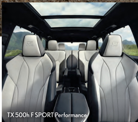
TX 500h F SPORT Performance