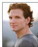
Sebastian Arcelus Into The Woods, Elf