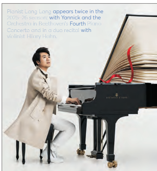
Pianist Lang Lang appears twice in the 2025–26 season: with Yannick and the Orchestra in Beethoven's Fourth Piano Concerto and in a duo recital with violinist Hilary Hahn.