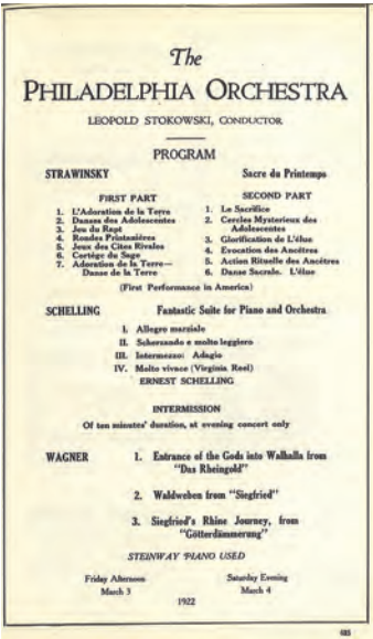
A program from the 1922 United States premiere of Stravinsky's The Rite of Spring