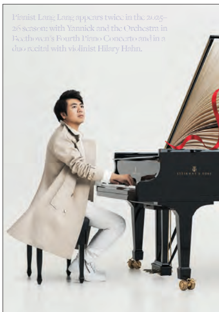
Pianist Lang Lang appears twice in the 2025–26 season: with Yannick and the Orchestra in Beethoven’s Fourth Piano Concerto and in a duo recital with violinist Hilary Hahn.

Past and present mingle in other ways throughout the upcoming season. Just as earlier generations of Philadelphians witnessed composer-conductors such as Zoltán Kodály, Virgil Thomson, Leonard Bernstein, and Luciano Berio interpreting their own works, the 2025–26 season features Matthias Pintscher conducting his Assonanza with violin soloist Leila Josefowicz.