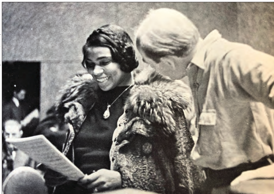
Marian Anderson with Music Director Eugene Ormandy during a Philadelphia Orchestra rehearsal at the Academy of Music in December 1938