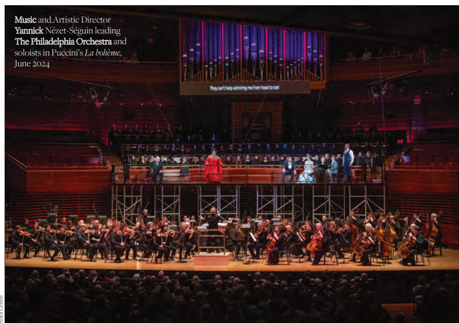
Music and Artistic Director Yannick Nézet-Séguin leading The Philadelphia Orchestra and soloists in Puccini's La bohème , June 2024

Among the more disruptive early examples of the "post- Tristan era" were Schoenberg's song cycle Gurrelieder (1900–11) and his monodrama for soprano Erwartung (1909). The latter is a sort of miniature Tristan , complete with a compact love-death finale. The Tristan effect can