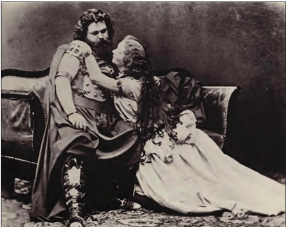
Ludwig Schnorr von Carolsfeld and his wife, Malvina, starred as Tristan and Isolde at the 1865 premiere of the opera.

The enervating power of Tristan is found in literature, too. Thomas Mann’s 1903 novella Tristan takes place in a sanatorium, where the fragile Gabriele (Isolde) is recovering from a tracheal illness. Fellow resident Detlev Spinell (Tristan) is a flighty writer who bonds with Gabriele over a love of the arts, much to the chagrin of her bourgeois husband, Anton (Marke). In Willa Cather’s vivid 1904 short story A Wagner Matinee , a young man living in Boston invites his aging aunt for a visit; as Aunt Georgina listens to a Boston Symphony all-Wagner concert, she melts into an emotional heap from the sense of loss: from a memory of the life she gave up.