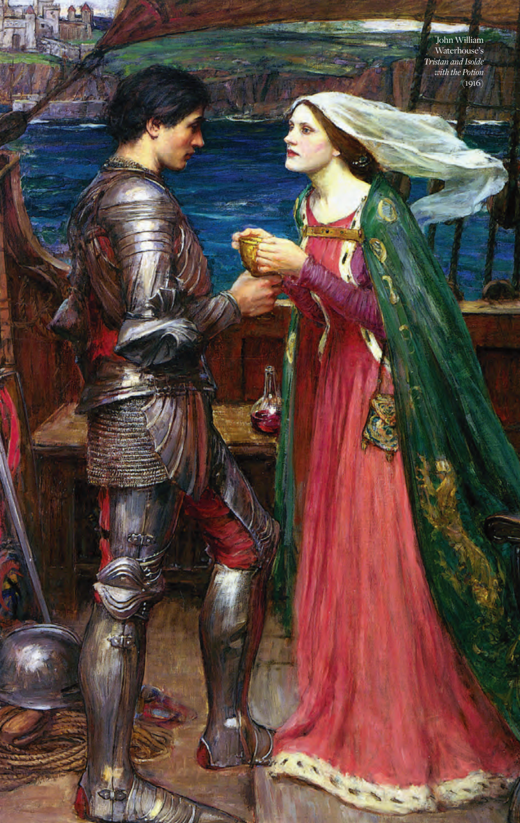
John William Waterhouse's Tristan and Isolde with the Potion (1916)