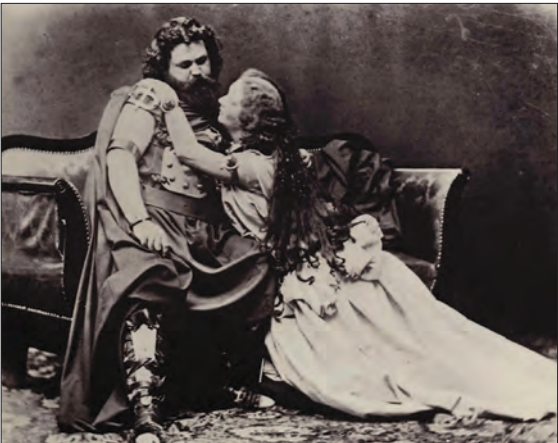
Ludwig Schnorr von Carolsfeld and his wife, Malvina, starred as Tristan and Isolde at the 1865 premiere of the opera.

The enervating power of Tristan is found in literature, too. Thomas Mann’s 1903 novella Tristan takes place in a sanatorium, where the fragile Gabriele (Isolde) is recovering from a tracheal illness. Fellow resident Detlev Spinell (Tristan) is a flighty writer who bonds with Gabriele over a love of the arts, much to the chagrin of her bourgeois husband, Anton (Marke). In Willa Cather’s vivid 1904 short story A Wagner Matinee , a young man living in Boston invites his aging aunt for a visit; as Aunt Georgina listens to a Boston Symphony all-Wagner concert, she melts into an emotional heap from the sense of loss: from a memory of the life she gave up.