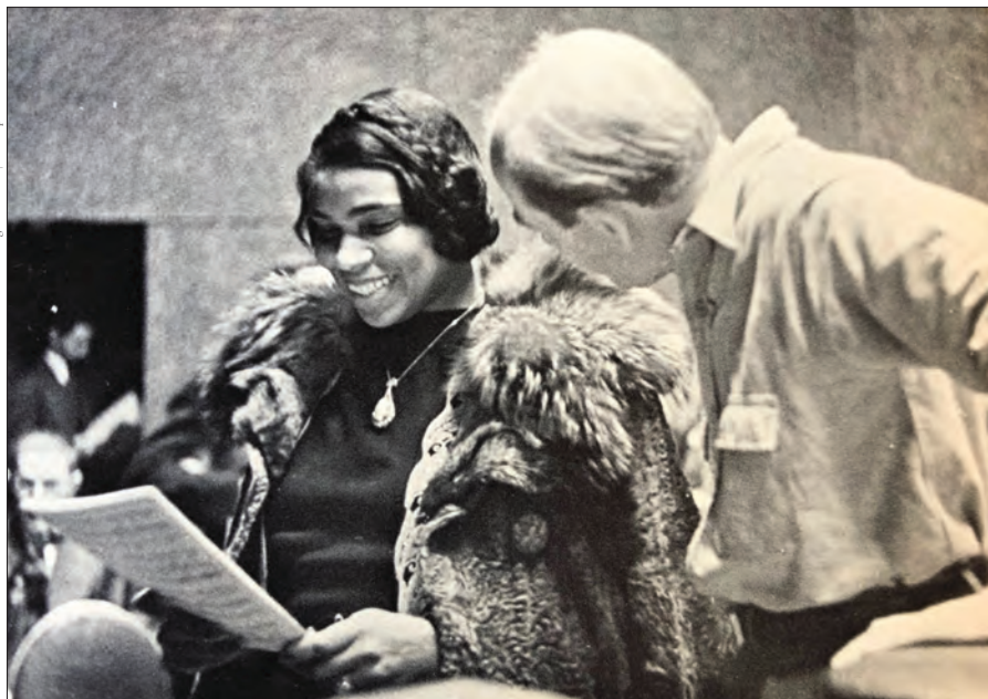
Marian Anderson with Music Director Eugene Ormandy during a Philadelphia Orchestra rehearsal at the Academy of Music in December 1938