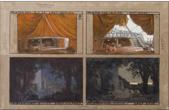
Alfred Roller’s set designs for Acts I and II of the 1903 Viennese production of Tristan and Isolde conducted by Gustav Mahler

Tristan has had an impact on the art world, as well. The early “conceptual” set and costume designs of Secession artist Alfred Roller, created for the 1903 Viennese production that Mahler conducted, helped push operatic production into an era of stylized abstraction, which ultimately reflected the art of the period.