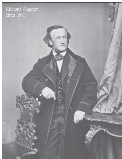
Richard Wagner, circa 1860

Nevertheless, in Wagner's world a love this ferocious brings a "sweet suffering" that can only be extinguished, or apotheosized, through death. King Marke arrives to forgive the couple and permit them to marry, but he is too late. Tristan succumbs to Melot's sword, and Isolde sings her "Liebestod."