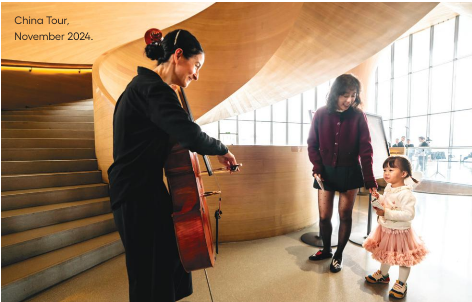
American orchestra to visit Hainan, marking another notable first in its history.

The final leg of the tour brought the Orchestra to Hainan, Haikou. Special thanks to Hainan Airlines, which provided a dedicated charter flight for the entire journey. With this trip, The Philadelphia Orchestra became the first