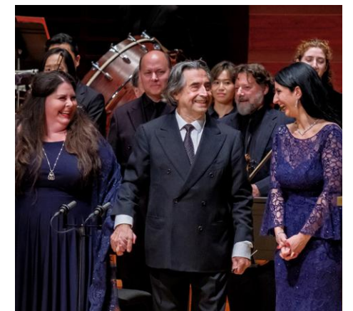
Riccardo Muti takes a bow after leading Verdi's Requiem.