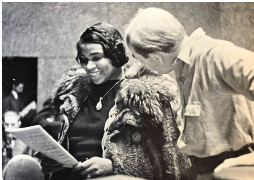
Marian Anderson with Music Director Eugene Ormandy during a Philadelphia Orchestra rehearsal at the Academy of Music in December 1938