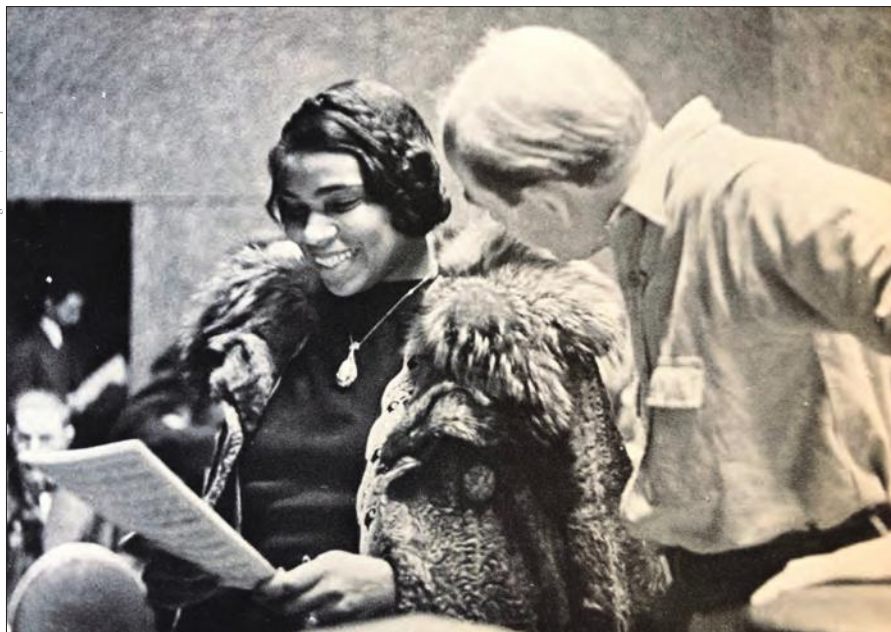
Marian Anderson with Music Director Eugene Ormandy during a Philadelphia Orchestra rehearsal at the Academy of Music in December 1938