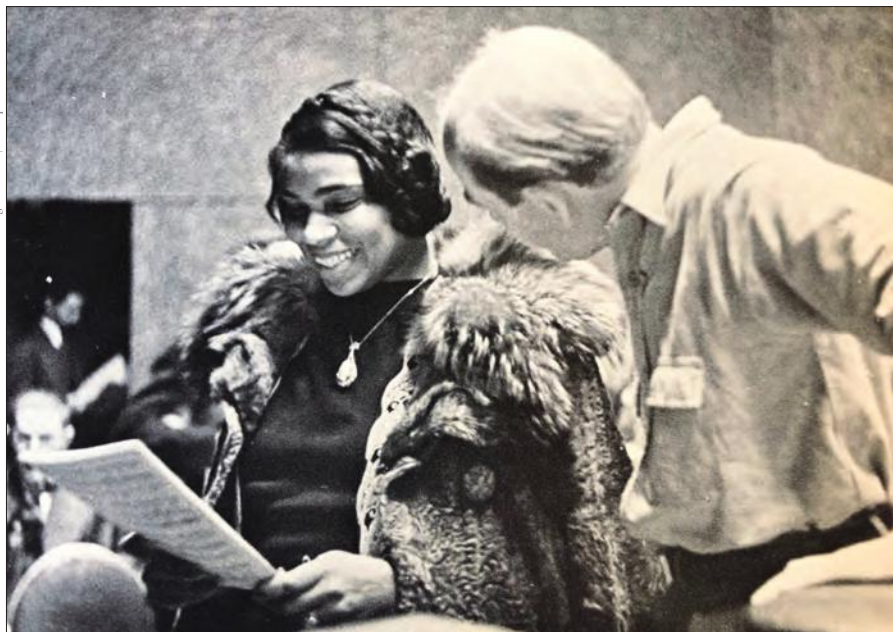
Marian Anderson with Music Director Eugene Ormandy during a Philadelphia Orchestra rehearsal at the Academy of Music in December 1938