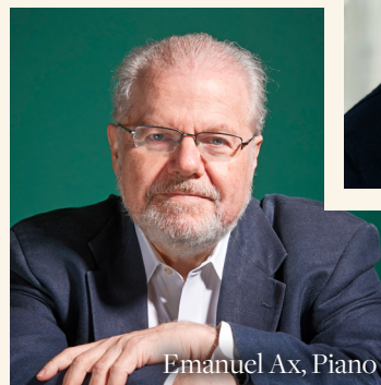
Emanuel Ax, Piano