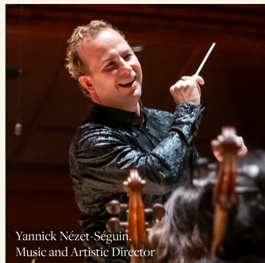
Yannick Nézet-Séguin, Music and Artistic Director