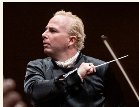
Yannick Nézet-Séguin, Music and Artistic Director

“Rainbow Waltz” Yannick Nézet-Séguin Conductor June 3, 5-6, 2027