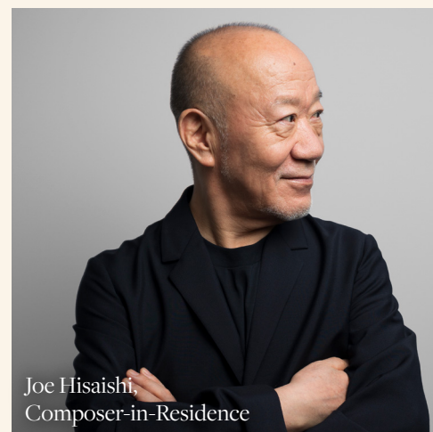
Joe Hisaishi, Composer-in-Residence

Orbis Yannick Nézet-Séguin Conductor September 24, 2026