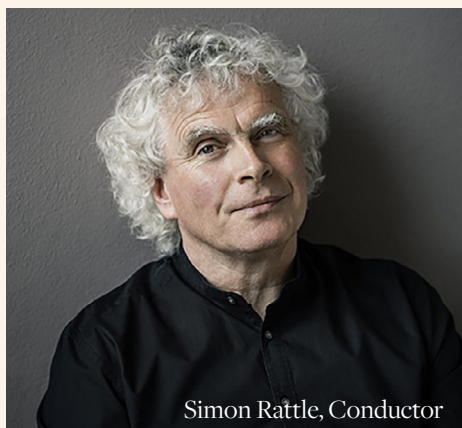
Simon Rattle, Conductor