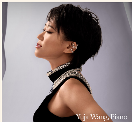
Yuja Wang, Piano

Philadelphia Girls Choir Philadelphia Symphonic Choir