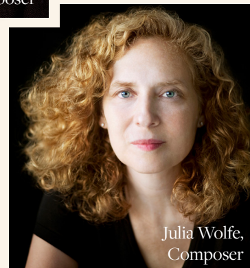
Julia Wolfe, Composer