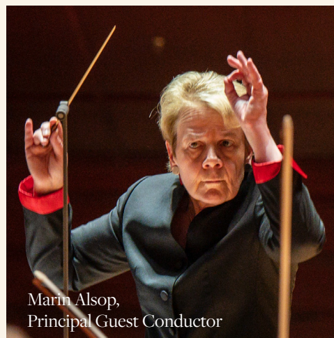
Marin Alsop, Principal Guest Conductor