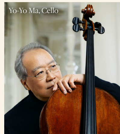
Yo-Yo Ma, Cello

The Philadelphia Orchestra does not perform on the Brodsky Star Spotlight Series.