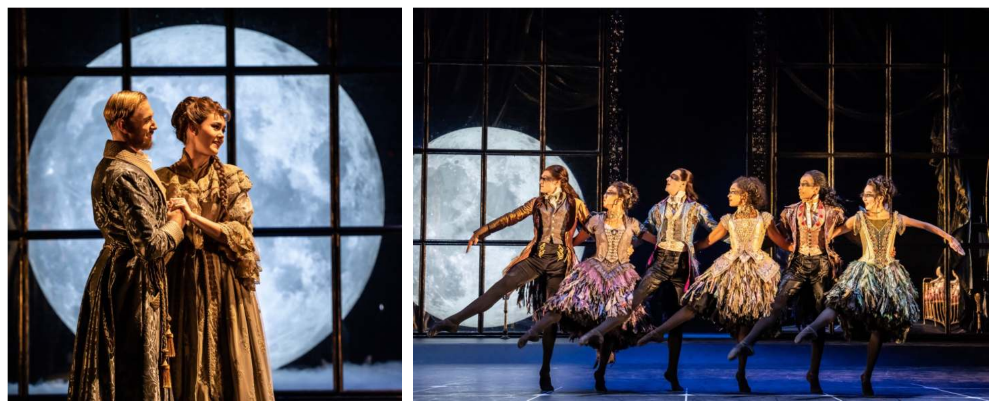
King Benedict & Queen Eleanor