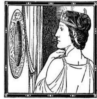
Snow White by The Brothers Grimm Illustrator Joseph Jacobs