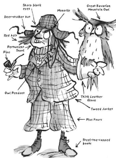
Awful Auntie.- Illustrator Tony Ross