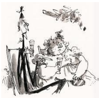
James and the Giant Peach

By Roald Dahl, illustrator Quentin Blake