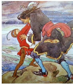
Peter Pan by J M Barrie, Illustrator Alice B Woodward