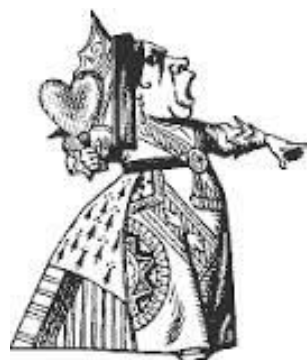
Alice in Wonderland By Lewis Carroll