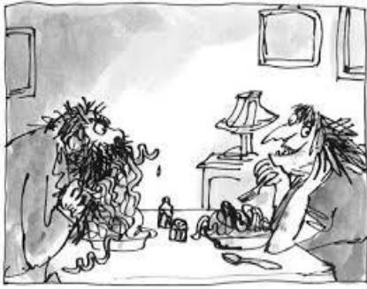
The Twits By Roald Dahl, Illustrator Quentin Blake