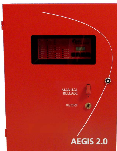
AEGIS 2.0 Control Unit with Switches