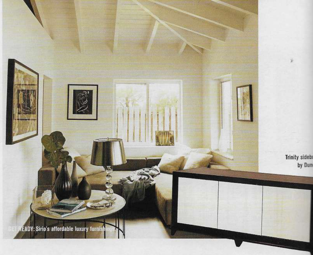
GET READY: Sirio's affordable luxury furnishings.