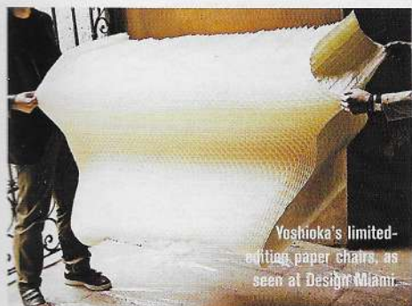
Yoshioka's limited-edition paper chairs, as seen at Design Miami.

Tokujin Yoshioka's glass-and-paper sculpture and artful collapsible paper chairs nestled into undulant waves of clear plastic straws in his Design Miami exhibition, which transformed the top floor of the Moore Building into an ethereal panorama. Though the 2007 Designer of the Year's installation is long gone from the Design District, the Driade showroom—the Italian retailer's first in the U.S.—carries a variety of shapely furnishings by the Japanese visionary. 4141 N.E. 2nd Ave., 305.572.2900, www.driademiami.com .