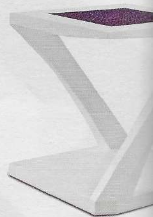
LETTER OF INTENT Sparkling Swarovski