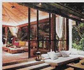
FASHION HOUSE Donna Karan's guest home in Parrot Cay, Turks & Caicos.