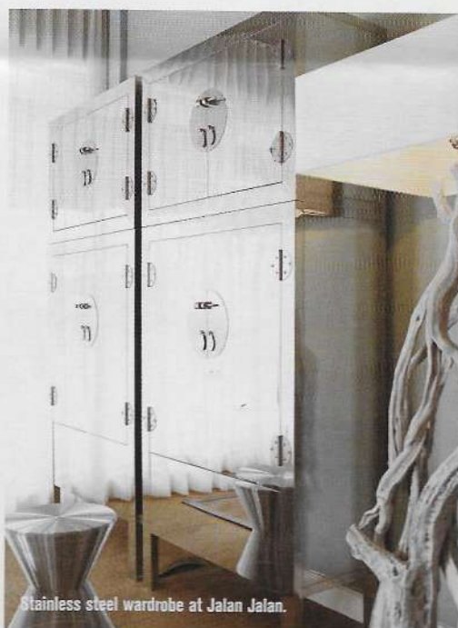
Stainless steel wardrobe at Jalan Jalan.

THE ASIAN DESIGN IS FAMILIAR, BUT THE MATERIAL OFFERS A SENSORY JOLT. THE TWIST ON THESE COMPOUND WARDROBES IS STAINLESS STEEL. WATCH FOR THE REFLECTION OF PUZZLED GUESTS GAZING UPON THESE UNUSUAL PIECES. ($17,500 EACH, AVAILABLE EXCLUSIVELY AT JALAN JALAN COLLECTION, 3921 N.E. 2ND AVE., 305.572.9998)