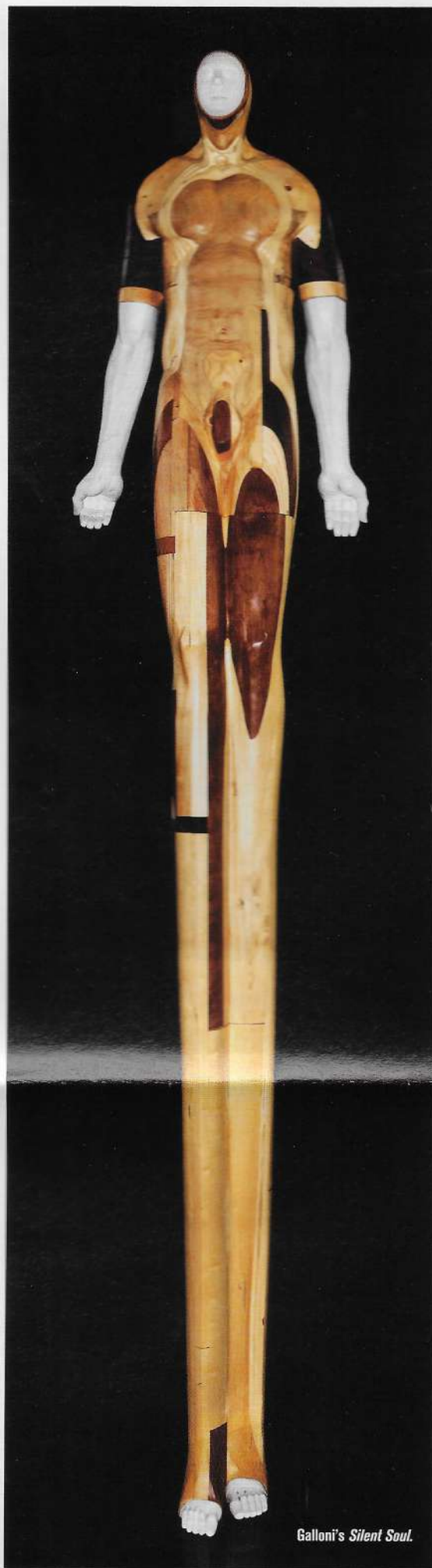
Galloni's Silent Soul.

The Living Tower by Vitra, inspired by '60s design, is a massive, three-dimensional and whimsical variation on the love seat. As much sculpture as furniture, the Verner Panton-designed tower ($13,010 at Vitra at 4141 Design, 4141 N.E. 2nd Ave., 305.572.2909, www.4141design.com/vitra ) stands nearly seven-feet tall and commands a room. Challenging the tower for floor space at Vitra is Ronan and Erwan Bouroullec's nearly eight-foot-long Alcove sofa ($8,280), which can comfortably seat the starting five of a basketball team plus a few backups.