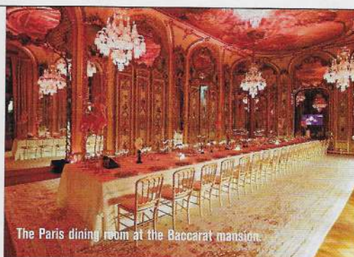
The Paris dining room at the Baccarat mansion.

When the Baccarat mansion redecorated its Paris dining room earlier this year, the larger-than-life house of style tapped Tai Ping to create a sumptuous, gold silk-stitched 18x40-foot rug to play off the room's inherent grandeur. Steal the look with a smaller version of the same pattern—Fin de Règne—for your own crystal palace.