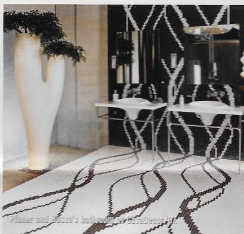
Finner and Busso's bathroom at Casa Deco Art

"I am interested in creating architecture that is experiential, highly tactile. When designing I worry about the small. The details and the proportions of the space sometimes down to the millimeter make all the difference." —Architect Gonzalez, currently designing a 20,000-sq-ft $50-million house in Miami.