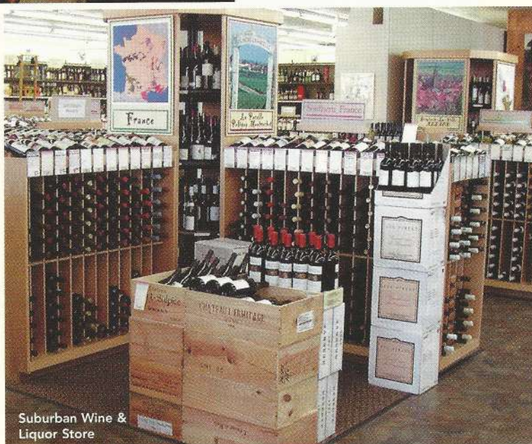
Suburban Wine & Liquor Store

Suburban sports a super-store atmosphere with roomy aisles that make for easy browsing. While the shop has a few rare California wines and some vintage French collectibles, it specializes in mid-priced wines from a number of countries known more for value than prestige. The offerings of Chilean, Spanish and Australian wines are particularly impressive. Some crowd-pleasing favorites include the Sauvignon Blanc from Chile's Casa Lapostolle ($8), Borsao ($6) from Campo de Borja in Spain, and the Australian Shiraz from Black Opal ($11). Other discoveries made by these value-hound buyers included the Dallas Conte Cabernet Sauvignon from Chile ($10) and the Joel Gott Zinfandel from California ($16).