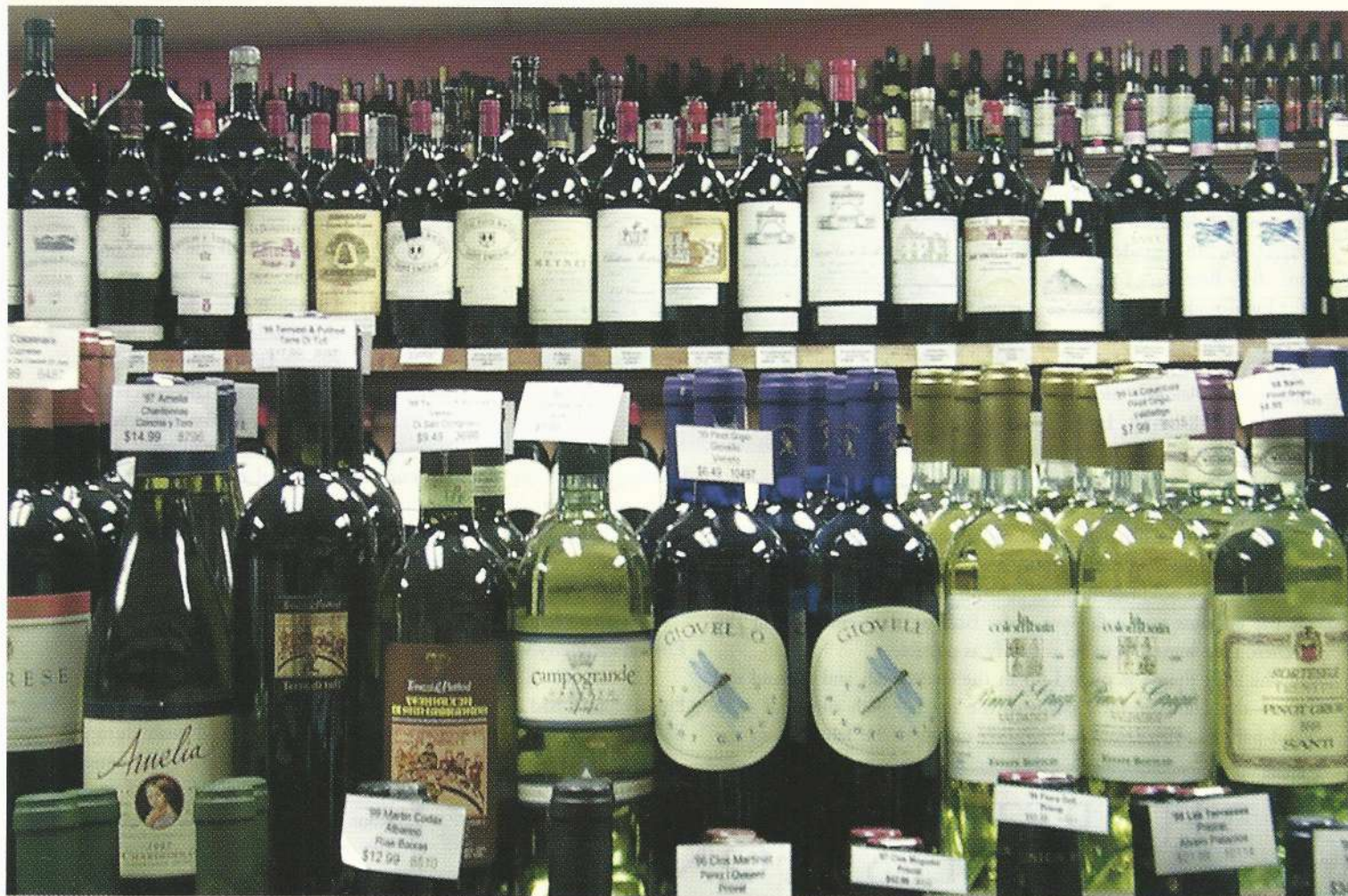
Rochambeau Wines & Liquors

For some, Westchester is a one wine-shop county. Zachys's tony Scarsdale address and its many years of attention-grabbing advertising have helped create a certain aura around the well-known store. But we set out to uncover some of the quieter treasures in Westchester wine retailing. We conducted an unforgiving examination of the availability of rare wines, the accessibility of knowledgeable staff and each shop's pricing policy. We visited eleven wine shops: We found the following among the best and unearthed a few surprises along the way.