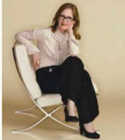
BARCELONA CHAIR BY KNOLL FROM DWR.COM

A s I think about our readers—men and women who are traveling around the globe—I am drawn to the newsy bits, buzzy items and interesting places, people and topics that connect us. Since there is far too much attention placed on what divides us, I prefer to celebrate the traits and interests we share.