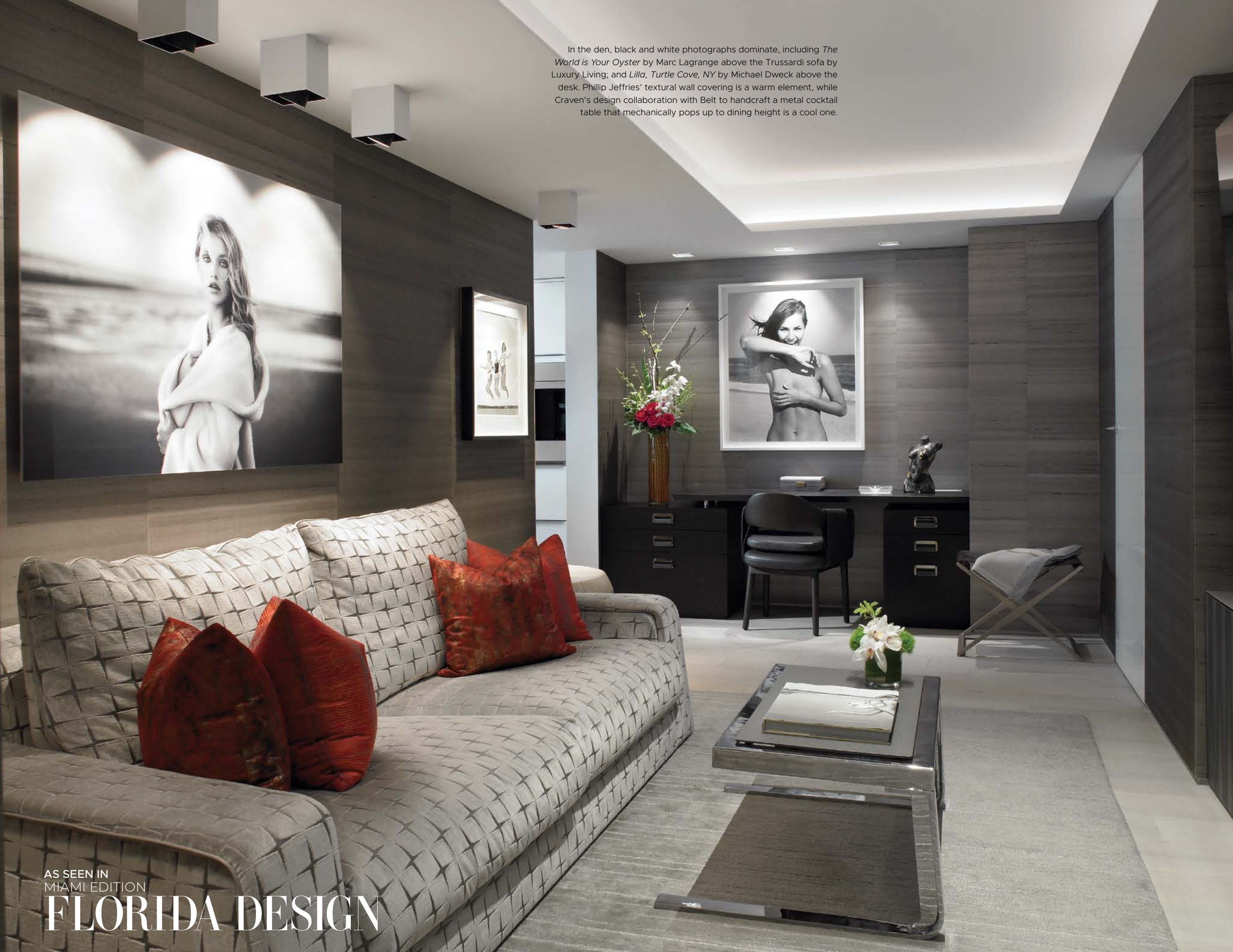
In the den, black and white photographs dominate, including The World is Your Oyster by Marc Lagrange above the Trussardi sofa by Luxury Living; and Lilla, Turtle Cove, NY by Michael Dweck above the desk. Phillip Jeffries' textural wall covering is a warm element, while Craven's design collaboration with Belt to handcraft a metal cocktail table that mechanically pops up to dining height is a cool one.