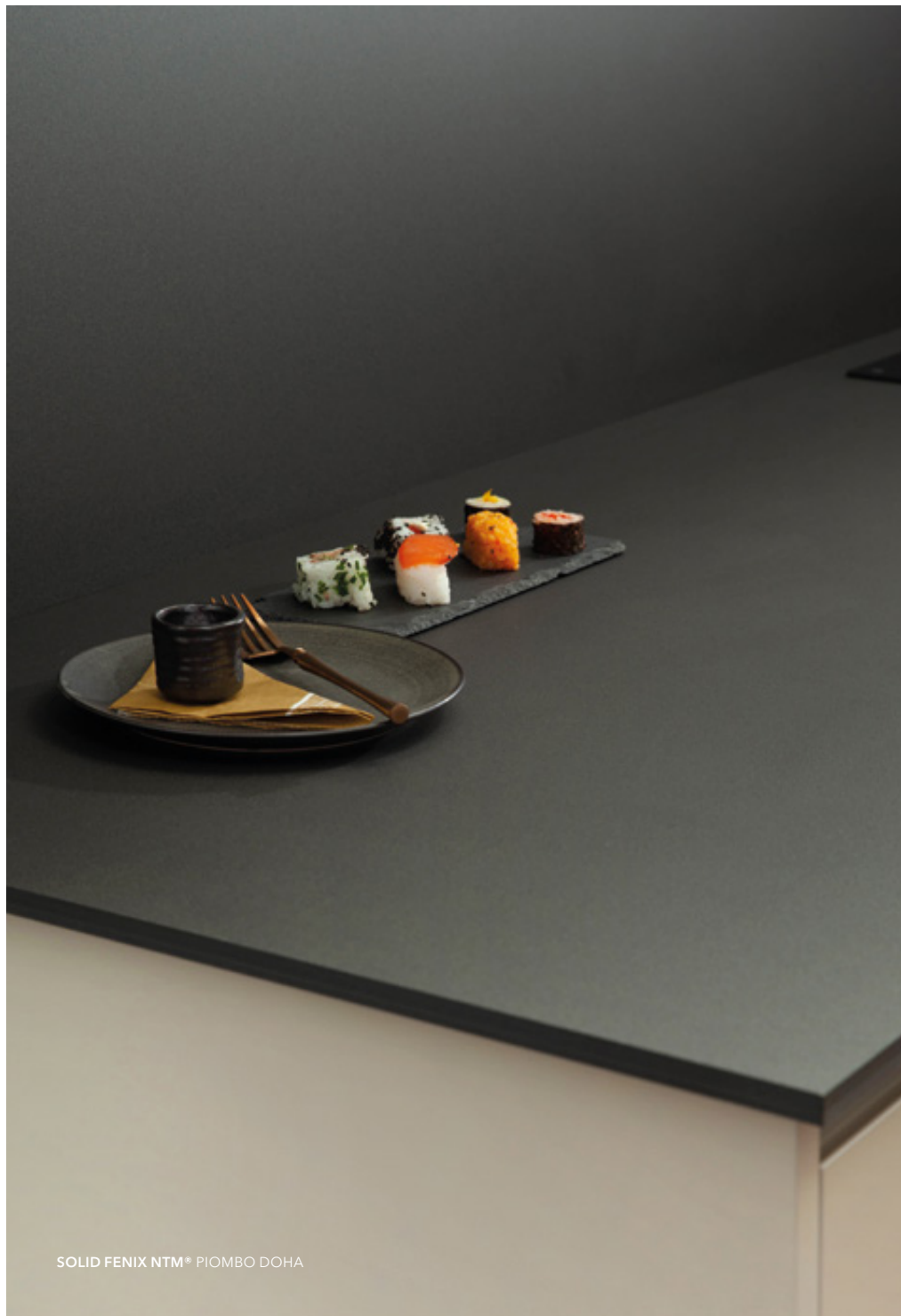
SOLID FENIX NTM® PIOMBO DOHA