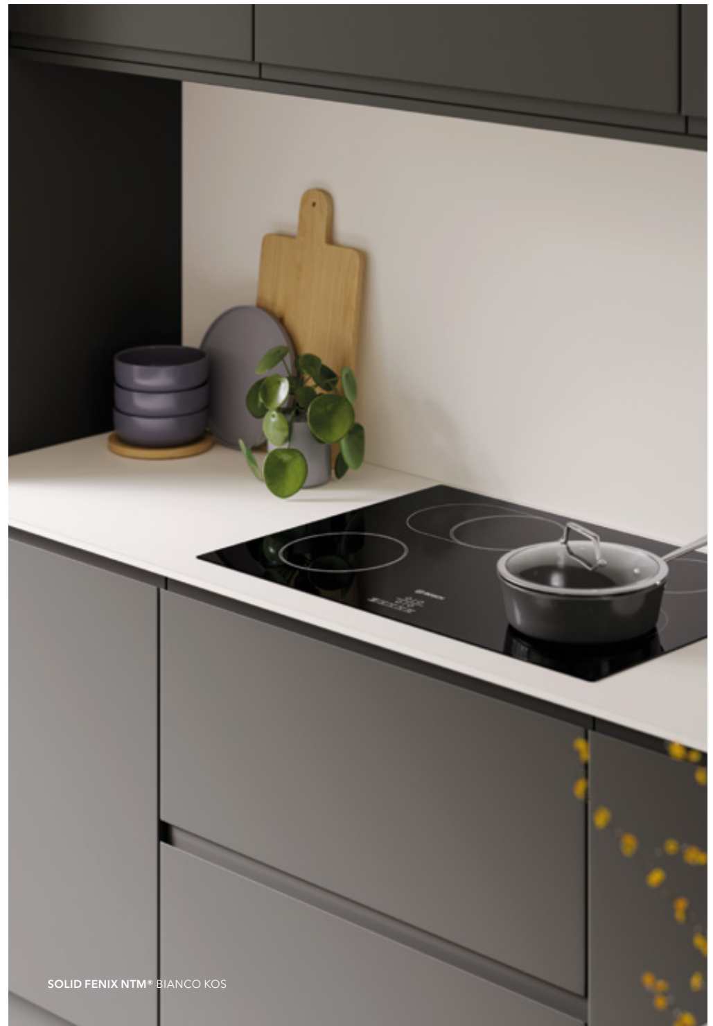
SOLID FENIX NTM® BIANCO KOS