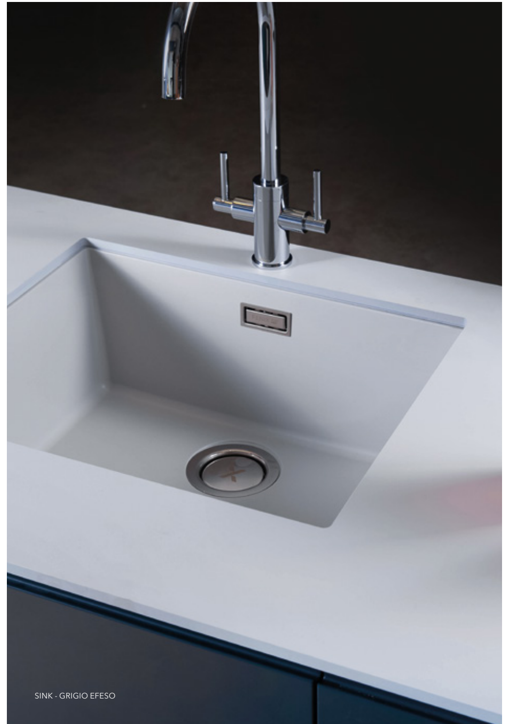
SINK - GRIGIO EFESO

Search for FENIX Maintenance and Cleaning on fenixforinteriors.com to find out more.