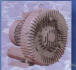
HB-529, 529L HB-629, 629L