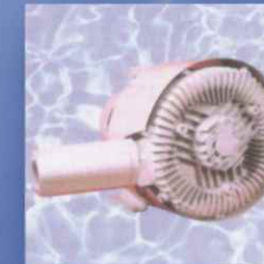
HB-6346, 6355, 6375