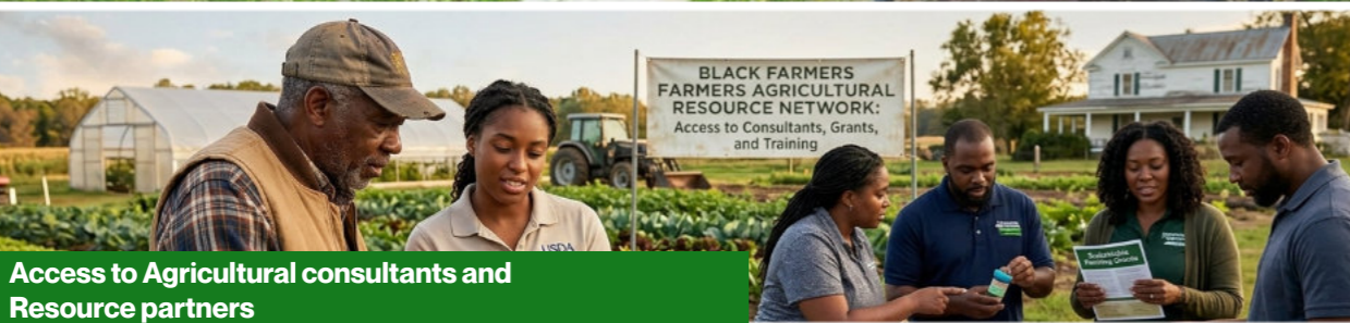
Access to Agricultural consultants and Resource partners