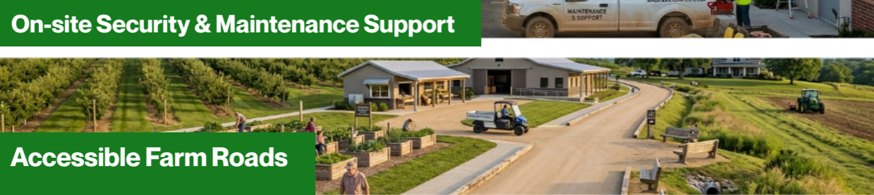
Accessible Farm Roads