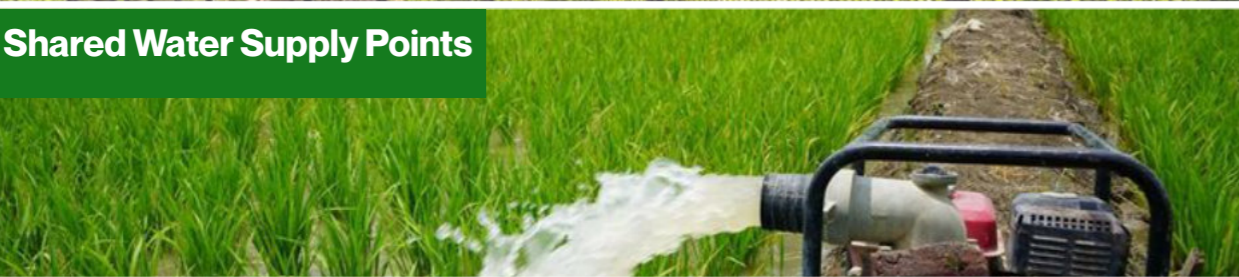
Shared Water Supply Points