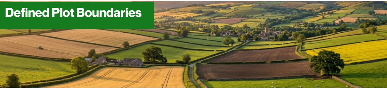
Defined Plot Boundaries