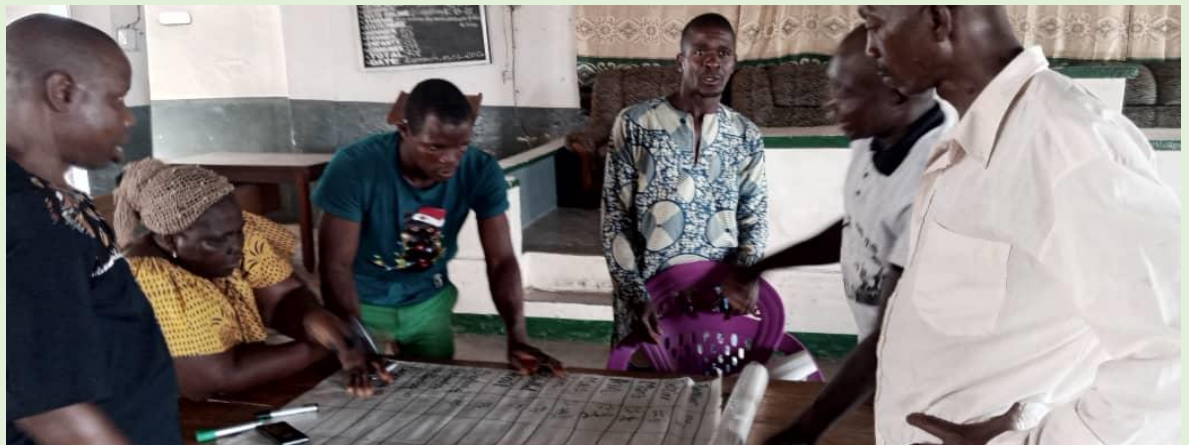
Practical session sessions drawing the Seasonal Calendar and Leaky Bucket.

In the 2023 Mission, we provided financial education