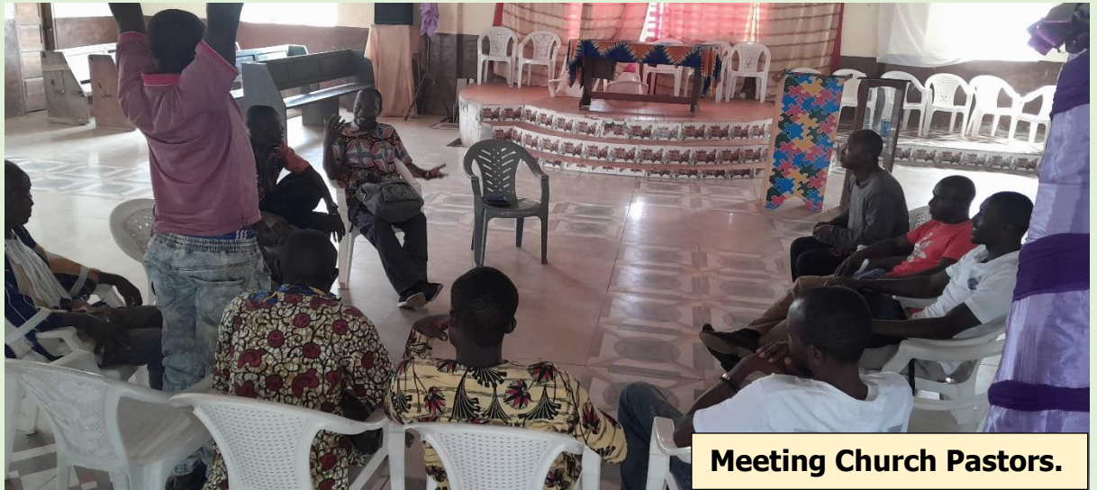
Meeting Church Pastors.

First , what transpired within the year from the training and resourcing from our previous trip and, the plan and schedule of our activities for our one week stay (in their country).