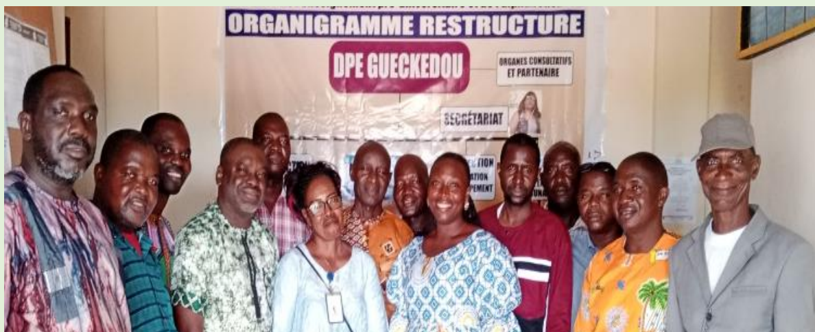
The TRIANGLE team members with the officials from the Education Ministry.

In Guinea , the new head of education invited all heads of the department (Teacher training, HR, Planning, Sports, Inspection, information etc) to meet and interface with us.