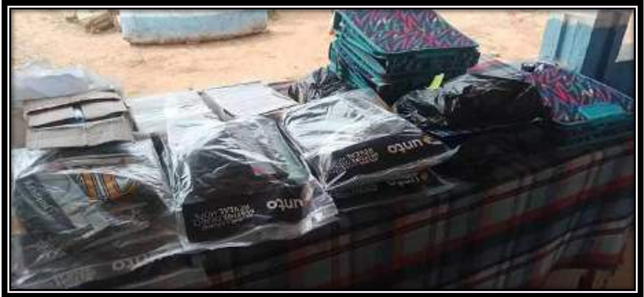
Folders, File bags, assorted writing accessories.

After the exciting victory by Foya Central High School from Foya, Liberia, we expected the Sierra Leonians to put up a stiff fight and this they did by defeating the runner up (Guinea) by 1 point!