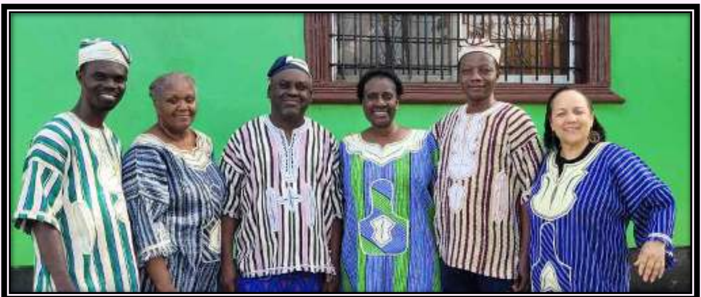
The 2024 TRIANGLE team members

Lots of clothing materials were distributed at the 2024 mission. Here, 10 elderly widows (the 10 th in absentia) were presented with Twinnee Creation Laces and Unique Design Ankara. A bag of Dayspring International Batik was assigned and randomly distributed. 6 sets of Male and female Jackets (and trousers) were given to Pastors.