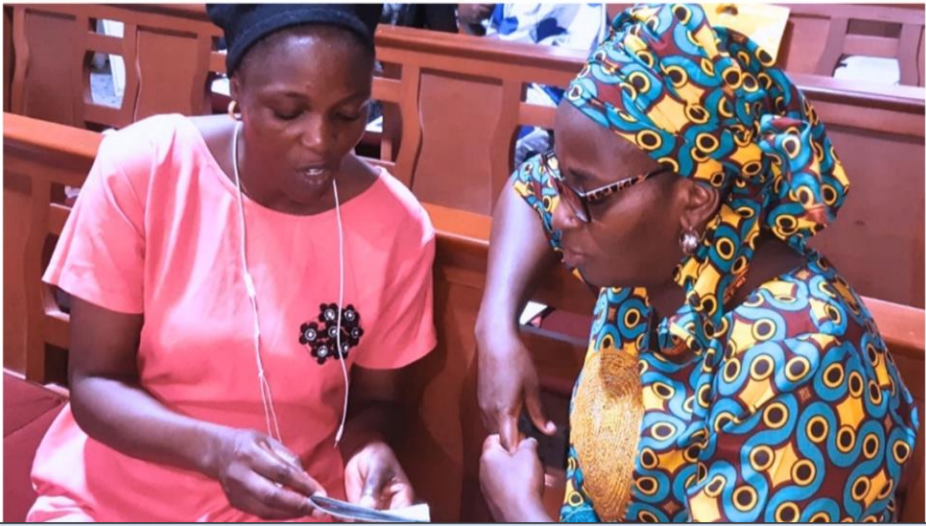
The Trainees practicing how to share their faith.

Among the courses in their calendar were these two that we facilitated.