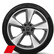
Audi Sport cast alloy wheels, 5-arm pylon style, Matte Titanium Look, diamond-turned, 8.5J x 19, 255/35 R19 tires