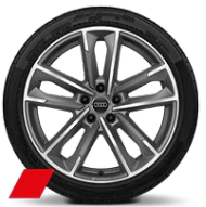
Audi Sport cast alloy wheels, 5-double-arm style, Matte Titanium Look, diamond-turned, 8.5J x 19, 255/35 R19 tires