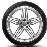
Alloy wheels, 5-parallel-spoke style 8.5J x 19, 255/35 R19 tires