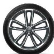
Cast aluminum wheels, 19 inch in 5-spoke Cavo design (S design), contrasting gray 8.5J x 19, 255/35 R19 tires