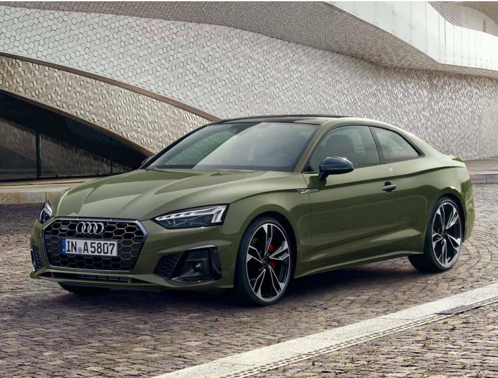
Audi A5 Coupè