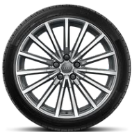
Cast aluminum wheels 19 inch, in multi-spoke design, contrasting gray 8.5J x 19, 255/35 R19 tires