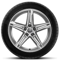
Alloy wheels, 5-double-spoke star style, 8.5J x 18, 245/40 R18 tires