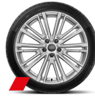
Audi Sport cast alloy wheels, 10-spoke V-style, 8.5J x 19, 255/35 R19 tires