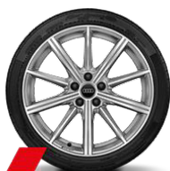
Audi Sport cast alloy wheels, 10-spoke star style, Platinum Look, diamond-turned, 8.5J x 19, 255/35 R19 tires