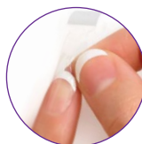
APPLY OVERLAY TO NAIL