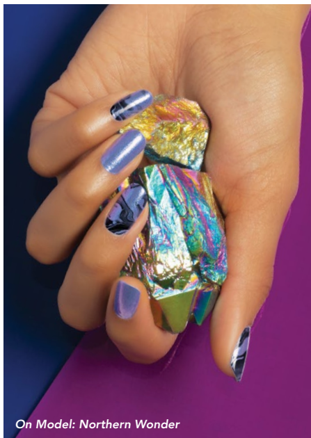
On Model: Northern Wonder