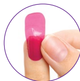
APPLY TO NAIL & GENTLY STRETCH TO FIT