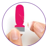
REMOVE CLEAR COVER