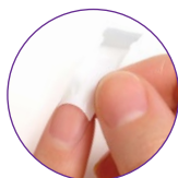
REMOVE CLEAR COVER & APPLY TIP TO FREE EDGE OF NAIL