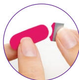
REMOVE TAB & SELECT END