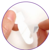
REMOVE CLEAR COVER & PEEL POLISH OVERLAY