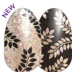
Laurel Gardens FDG230