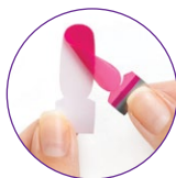
PEEL POLISH STRIP