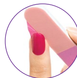
GENTLY FILE EXCESS OR REMOVE WITH FINGERNAIL