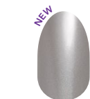
London Fog FMS102 shimmer