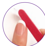
GENTLY FILE EXCESS OR REMOVE WITH FINGERNAIL