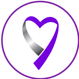
February 2021 Domestic Violence Awareness