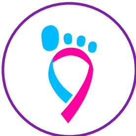
September 2020 Pregnancy & Infant Loss Awareness