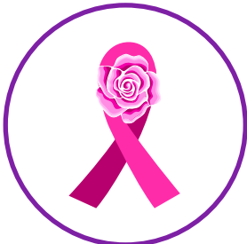
October 2020 Breast Cancer Awareness