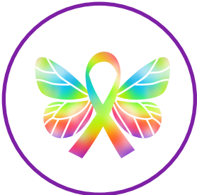
March 2021 Autoimmune Disease Awareness