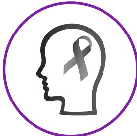
May 2021 Brain Cancer Awareness