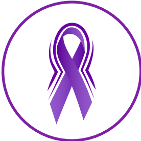
January 2021 Epilepsy Awareness