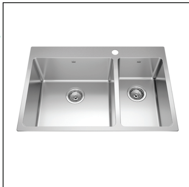
Brookmore Topmount/Drop In