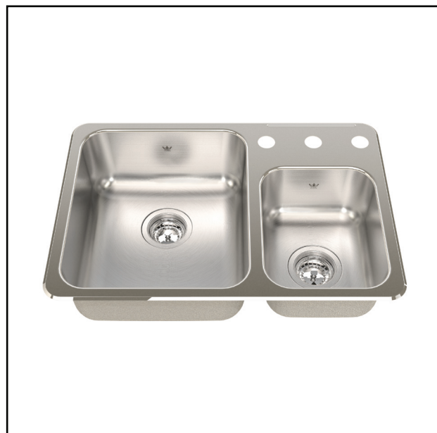
Steel Queen Topmount/Drop In