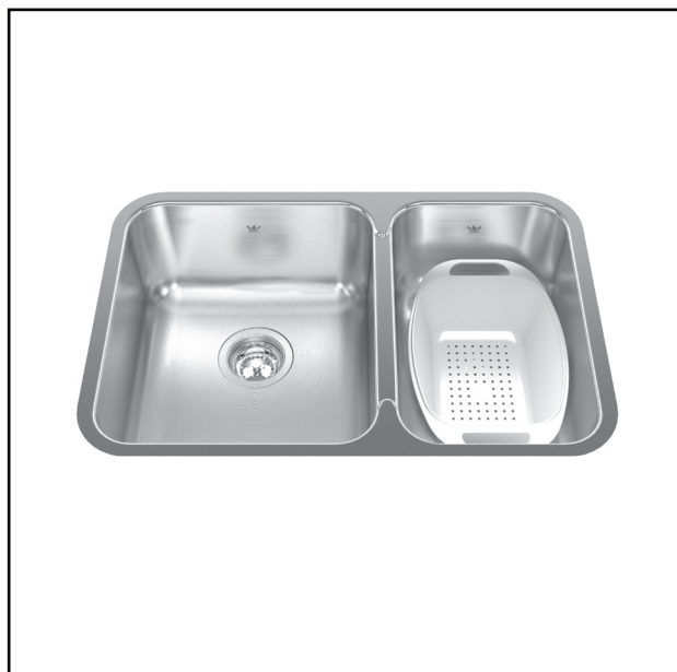
Steel Queen Undermount