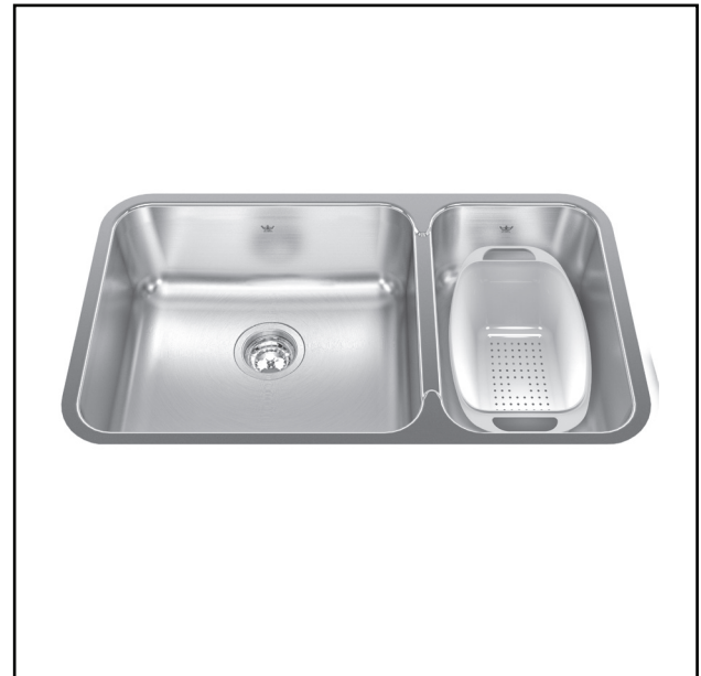
Steel Queen Undermount