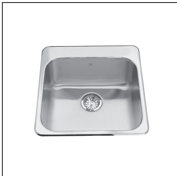
Steel Queen Topmount/Drop In