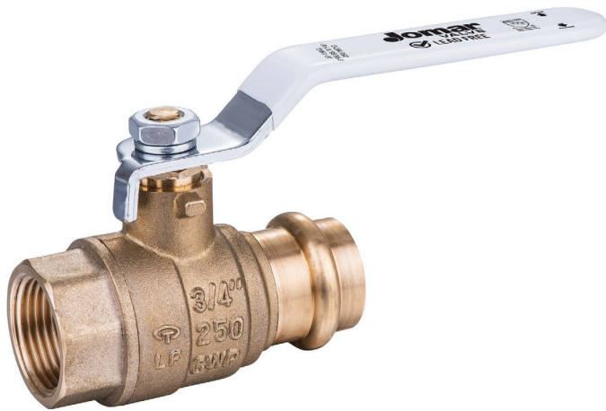
JP-150G Press X FIP