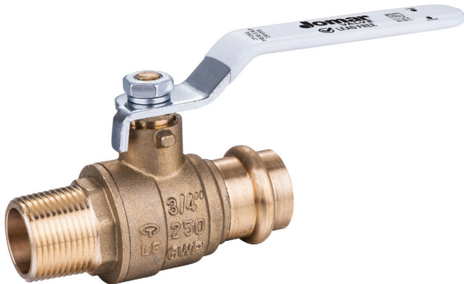
JP-150G Press X MIP